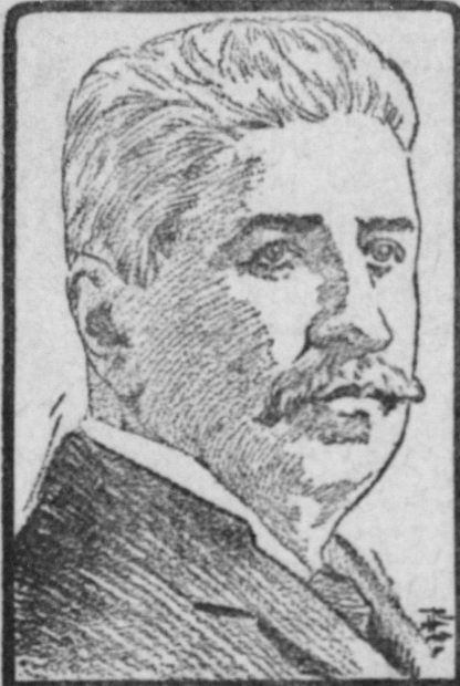
PRESIDENT MONTT OF CHILE AND A STREET SCENE IN VALPARAISO.

called the Yankees of South America, and their feelings toward the people of the United States are especially cordial. Our commerce with Argentina has been increasing lately, but is not yet of the proportions it should be considering the nature and extent of the exports from that country and the agricultural and mineral wealth it possesses.