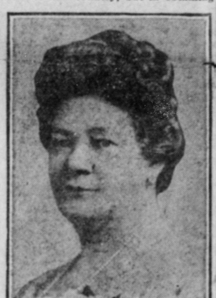
MME. ERNESTINE SCHUMANN-HEINK.

It was over these sons that there was a now celebrated controversy between the American state department and the German authorities. They were detained by the German government on the ground of their being liable to military service when the singer attempted to assemble her family about her in the United States. She succeeded at last not only in bringing them to this country, but in obtaining