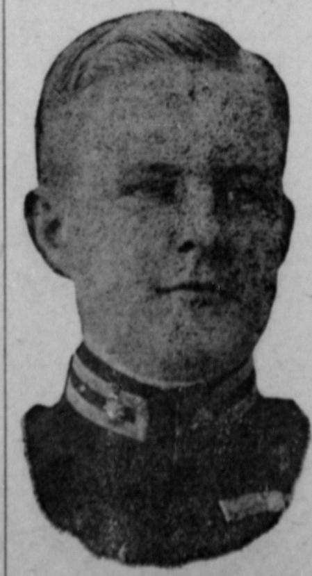
LUIZ FILIPPE, DUKE OF BRAGANZA.

The prince was born in 1857 and has been well educated. He speaks several languages and in general has conducted himself in a manner to win the approbation of his future subjects.