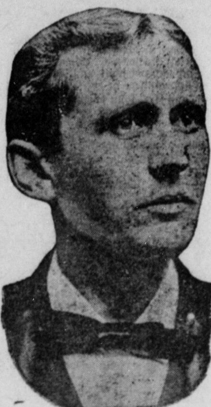
FRANK B. KELLOGG.