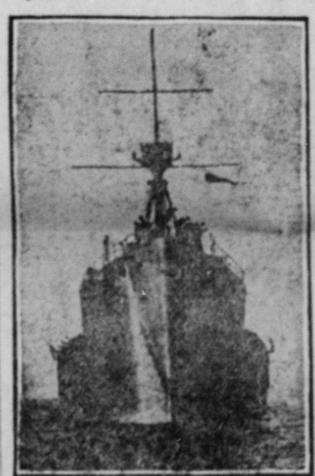
THE DREADNOUGHT-BOW VIEW.

building of big ships for warfare, and displacement of 18,000 tons. Her speed