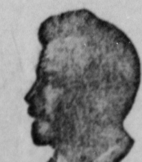
OSCAR HAMMERSTEIN. HEINRICH CONRIED.