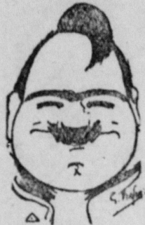
CARICATURE OF EN-CARUSO. RICO CARUSO.

Opening of the Grand Opera Season in America—Two Rival Organizations in the Field—Lina Cavalieri and Caruso—Grand Opera's Beginning in the New World