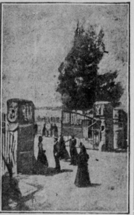
MAIN ENTRANCE OF THE PRESIDIO. post or barracks. The Presidio of San Francisco was established as an army

Much has been heard since earthquake and fire overwhelmed and destroyed San Francisco about the Presidio, the military reservation in the suburbs of that stricken city. During the Philippine insurrection it was the rendezvous of troops on their journey to the battlefields of the far east, and at one time 6,000 soldiers were quartered there. "Presidio" is a Spanish term, and its common acceptance in Spanish-America and in English speaking localities where Spanish names have been adopted is that of an army