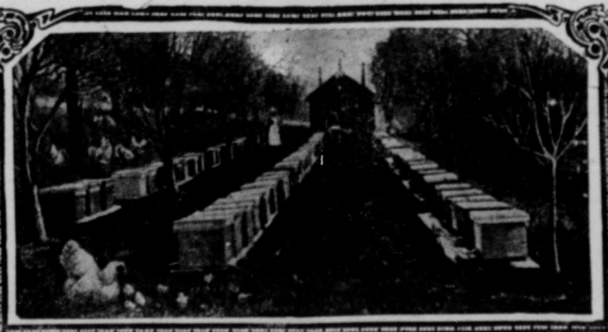
POULTRY, BEES AND FRUIT ON A SOUTHERN FARM.