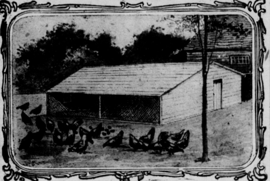
POULTRY BUILDING SUITABLE FOR SOUTHERN CLIMATE.

the Gulf in the Atlantic States of presence of which always enriches and this country can be found about the fertilizes the soil, providing that care same climate as is prevalent along and attention be given to the eco- a good hatch from a setting of eggs, the Pacific coast south from San Fran- nomical saving of the manure and a the fertility of the eggs used is of clsco. The State of California, the proper distribution of it over the land. prime importance. Data regarding the effort successful; the railroads, the ter schools, better education, better state statisticians, the agricultural homes, and to better improve their department and the people kept it lands. Only a short time since there