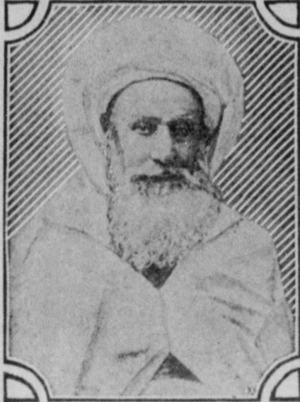
MOHAMMED EL TORRES.

The most striking figure at the conference in Algeiras, Spain, over Morocco affairs is the head of the Morocco delegation, the venerable Mohammed El Torres. He is the confidant of the young and picturesque ruler of Morocco, Mulai Abdul Aziz, and his minister of foreign affairs. There was a spectacular scene when the Moorish envoys embarked at Algeiras from the Spanish cruiser Rio del Plata. The party consisted of sixty-seven persons, all richly garbed in flowing white robes