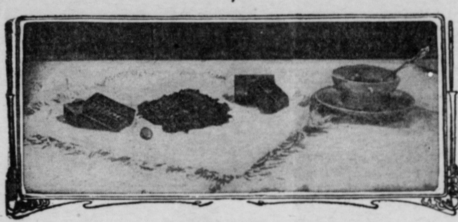
TEA TABLETS. The Bulk of Loose Leaves is Equal to One Box of Tablets.

Department of State and the Chinese effort of the Department of Agriculture nese tea growers for supremacy in Government from the celebrated Dragis to furnish pure tea in a most conthe world's tea trade. The most imon's Pool estate near Hangchow, China, Government from the celebrated Dragvenient form and in a manner to pro-tect the leaves from losing any of their strength through exposure to of modern and specially constructed lets, each of sufficient size to make a delicious cup of tea. What would ordinarily make a big package of tea can by this unique method be placed in a space about the size of a safety match box. Another significant feature stances have occurred of fine plucking pounds of greenleaf whereas the average in the Orient hardly exceeds 20 to 30 pounds. Experiments at the Pinehurst gardens show that tea from all of the experiment is that the tea used watch, thermometer, and steam or modern climates could be made as pro-