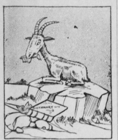
THE GOAT DEVOURED THE DICTIONARY.

One day a goat found a pile of tomatos and proceeded to devour them. A poet passed that way and, gazing on the goat, said: "Thy visage is that of a goat, but thy actions are decidedly asinine."