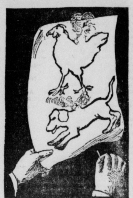
PICTURES MADE BY FIRE.

A Pretty Trick With Which to Puzzle Your Young Friends. This is a very pretty trick, especially if it is performed in a darkened room.