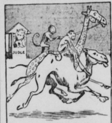
TROTTED UP TO THE LINE.

"Ha, ha! I shall win!" cried Mumbo, looking at Jumbo's horse, "Who can