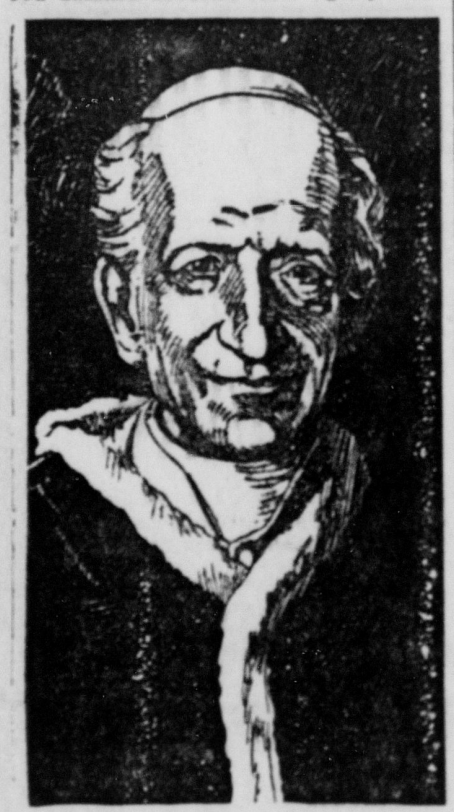
POPE LEO XIII.

The emaciated and lifeless frame which held so brave a spirit lay on the bed in the Vatican beside which almost all the world has prayed. The red damask coverlet rests lightly over