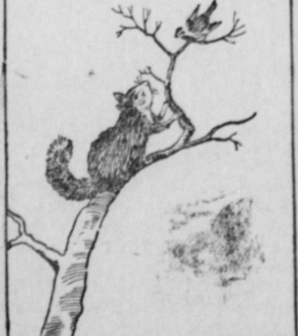
THE SPARROW AGREED.

One day the squirrel was feeling in a bad humor, which is not nice in little squirrels any more than it is in little boys and girls, and when the sparrow was trying to take a little nap on a twig of the tree the squirrel shook the limbs so hard that the poor sleepy head could get no rest.