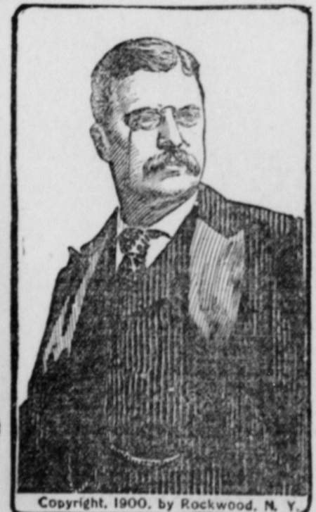
VICE PRESIDENT ROOSEVELT.

New York Republicans rolled up a tremendous majority up the state. Be-