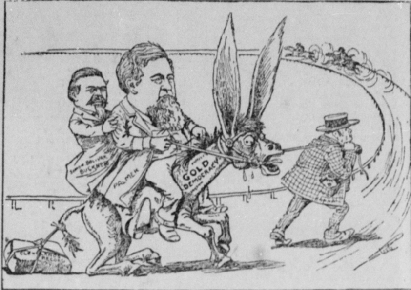
THEY'RE OFF!

5TH. From the foundation of the government until 1873, we had the same money laws—the free coinage of gold and silver. After that we demonetized silver, which left only gold as our primary money. Since then we had bad silver legislation (not free coinage) which almost depleted the treasury and caused the panic of '92 and left us at the mercy of the bankers on Wall street, who skinned the government continually by con-