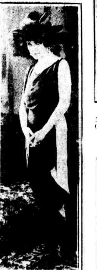
GANNA WALSKA TO ARRIVE SOON for first concert tour since marriage.