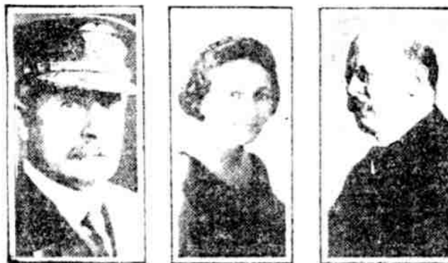
THEY ARE THE... BOARD