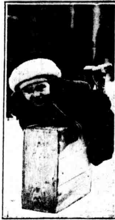
"JUST AS GOOD AS A SLED," little girl says, proving necessity is the mother of invention.