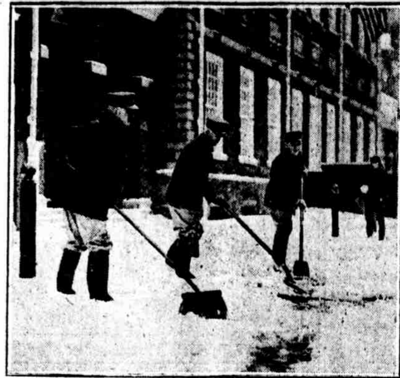
CLEARING THE SNOW FROM THE PAVEMENT IN FRONT OF INDEPENDENCE HALL. The camera caught the workmen shoveling and sweeping industriously at their task, yesterday.