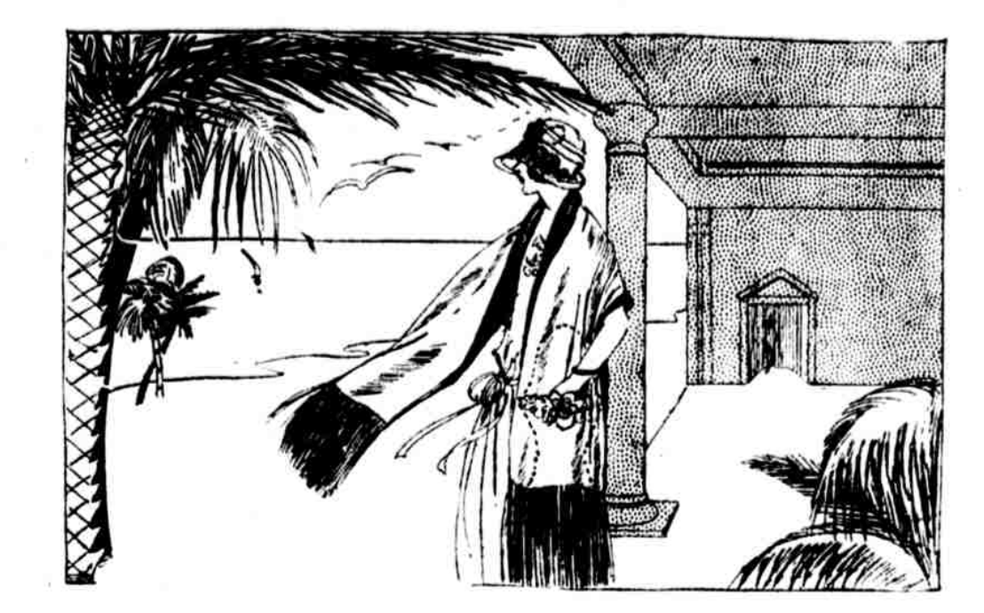
Blue Skies, Green Palms and White Shores Will Be a Perfect Background for These

They are at Wanamaker's now, a brilliant company to take where brilliant people gather.