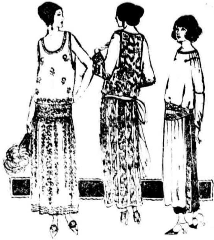
Women's French Gown, $29.75