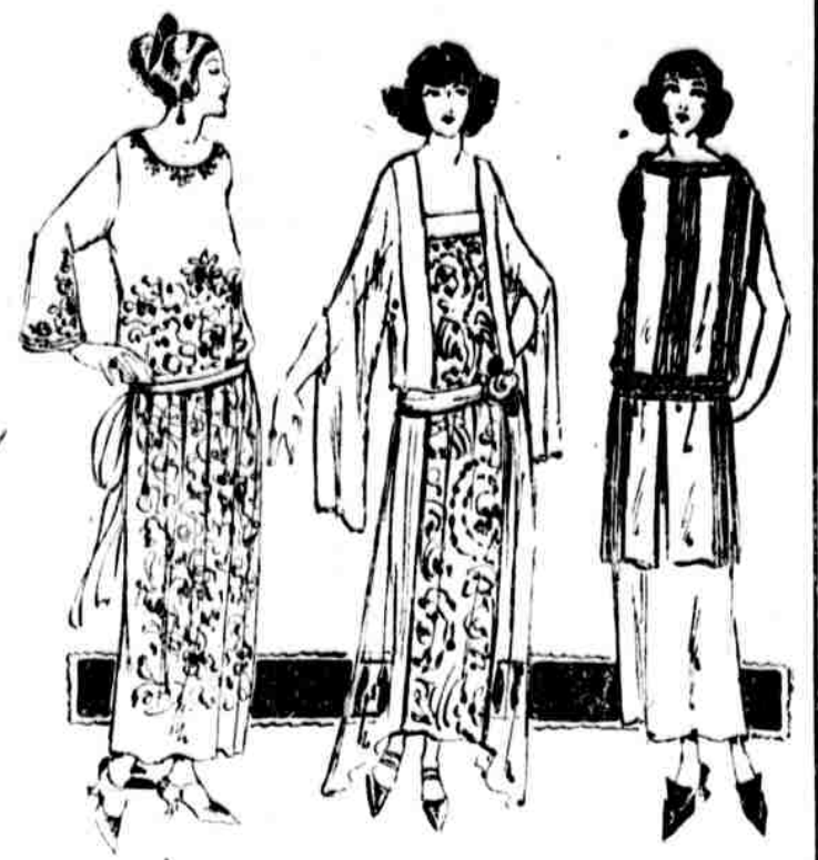
Women's French Gown, $29.75