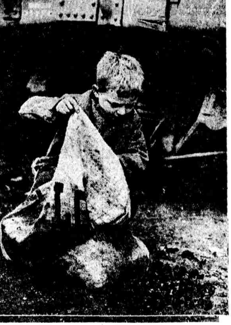
That's what this youngster said today as he gathered scraps of pea coal along the Washington avenue railroad tracks. "We're sure to heat the house for old Santa Claus, anyway," the boy added. Hundreds of persons, their homes cold because they can't get coal, walk the railroad track picking up the "drippin'" from coal cars.