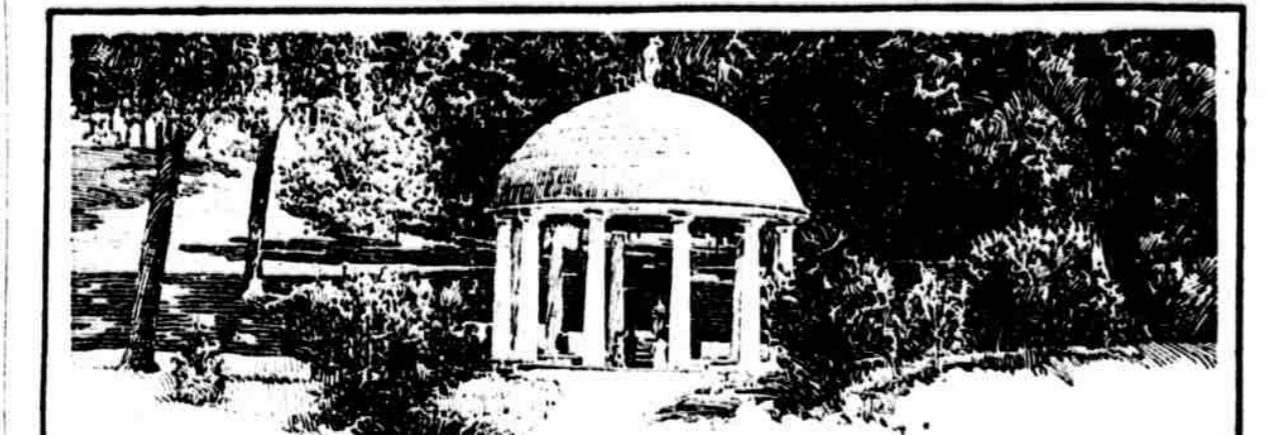
W. S. S. WATER A Natural Aperient—America's Morning Drink