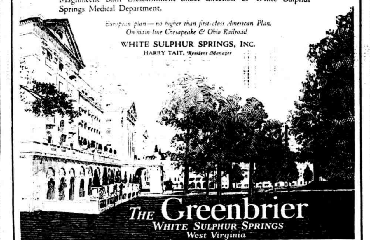
THE Greenbrier WHITE SULPHUR SPRINGS West Virginia

A great country house in a picturesque, wooded mountain park. Open fires, music, dancing, rare social charm, distinguished companionship. Wonderful golf, sun-lighted swimming pool, enchanting trails for foot or horse. Magnificent Bath Establishment under direction of White Sulphur Springs Medical Department.