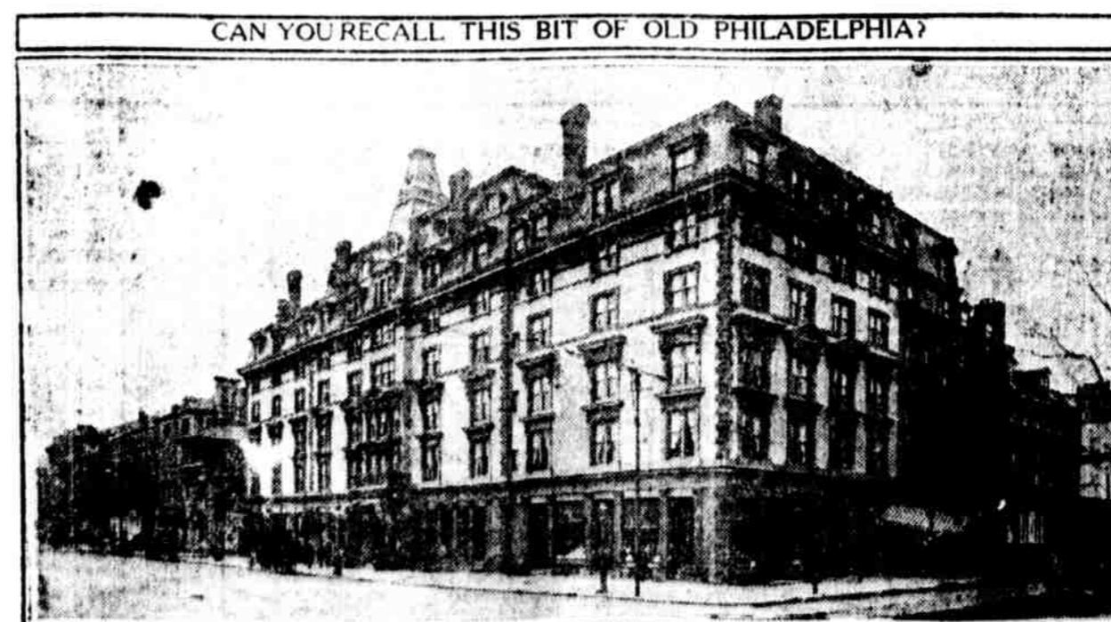
MANY PROMINENT PERSONALITIES OF YESTERYEAR made the old Stratford Hotel their headquarters when visiting Philadelphia. Above is a view of that establishment as it appeared on the southwest corner of Broad and Walnut streets, in 1897, the present site of the Bellevue-Stratford. Please send us your old Philadelphia photographs.