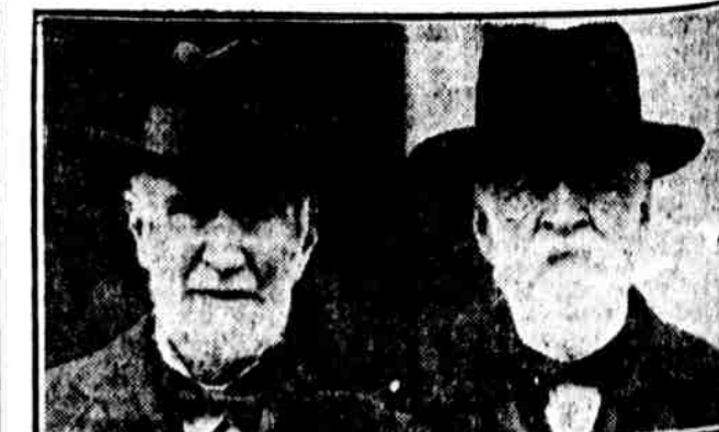
TWO OLDEST MEMBERS OF CONGRESS on first visit together to the White House. Uncle Joe Cannon, 86-year-old Republican, and Charles M. Stedman, 81-year-old Democrat.