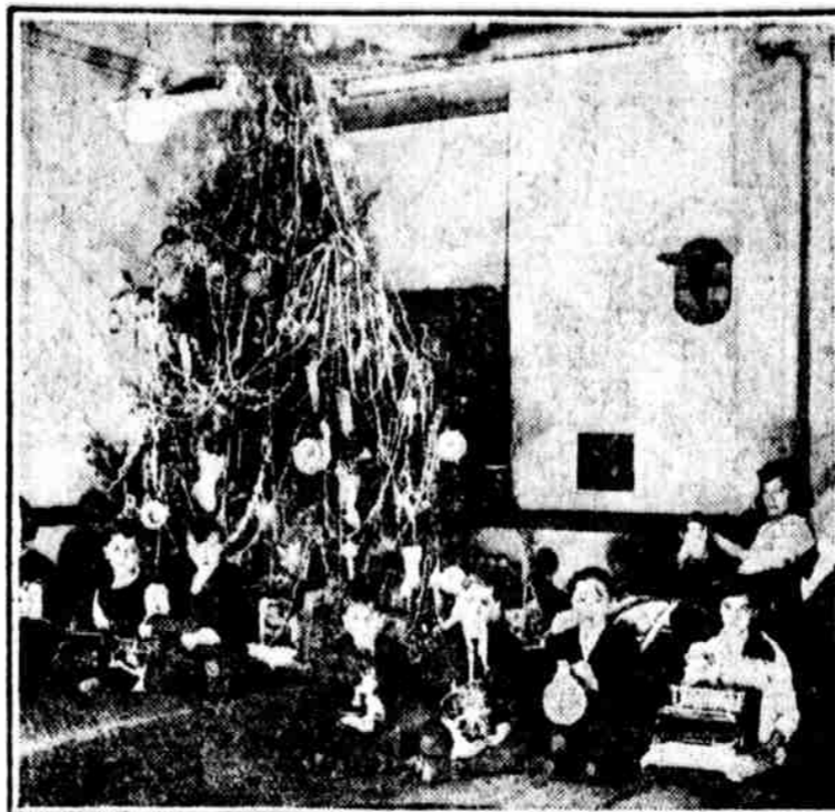
JEFFERSON HOSPITAL KIDDIES ENJOYED THE CHRISTMAS PARTY given by members of the Philadelphia Electric Company. Some of them are shown gathered around the tree.