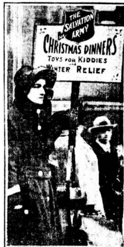
ONE OF THE SALVATION ARMY LASSIES who are helping the kiddies to a real Christmas.