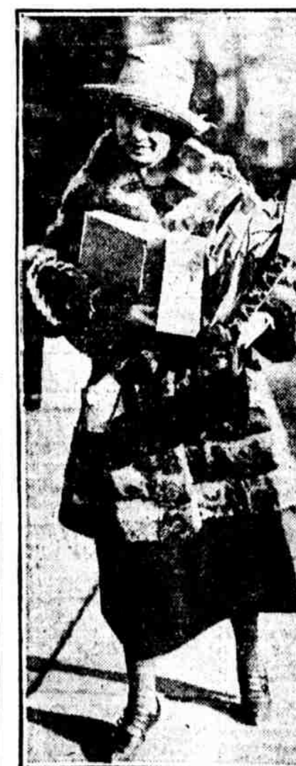
EVERYBODY'S DOING IT. Everywhere one looks one sees fair shoppers hurrying here and there with arms full of packages, and toys and wreaths, their eyes alight with the Christmas spirit.