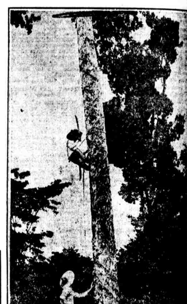
CHEWING GUM ADDICTS, behold the source of your pleasure. The gatherer "shinnies" up chicle tree, slashing bark with his machete. The sap is then gathered in a pail.