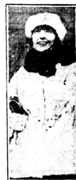
MISS PEARL WHITE, screen star, makes twenty-seventh trip to Paris.