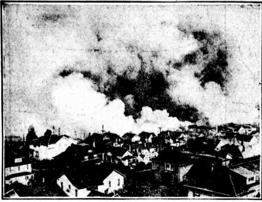
A GENERAL VIEW OF THE FIRE-STICKEN AREA OF ASTORIA, ORE., where flames swept through a great part of the city, destroying much property. The loss is placed at $15,000,000.