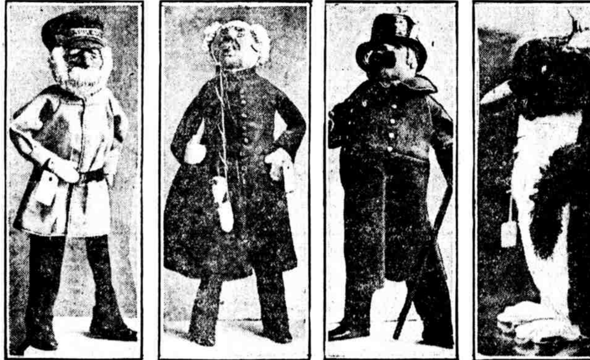
A PEEP INTO SANTA'S GIFT BAG. Some of the quaint and lifelike character rag dolls included in this year's lot of Yuletide novelties which will undoubtedly bring joy to the hearts of many kiddies this Christmas. These dolls are made in London and have had quite a large sale both in America and abroad.