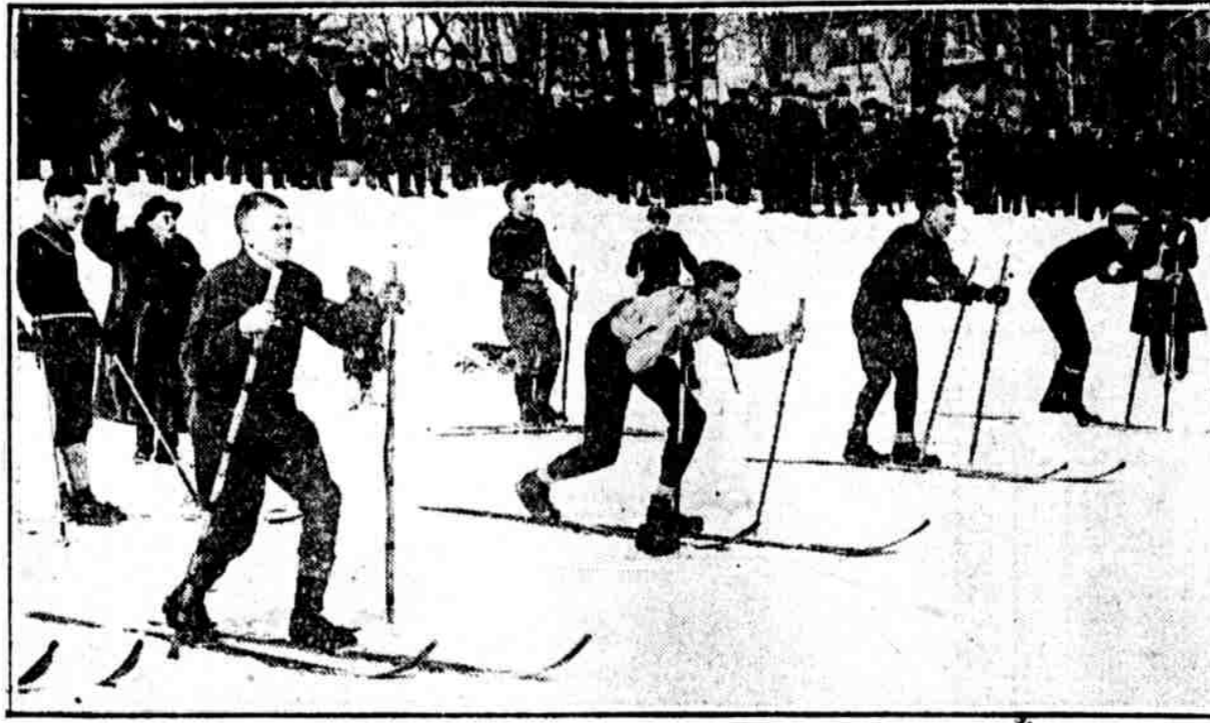
THE SHARP REPORT OF THE PISTOL was the signal for the start of the international intercollegiate ski race on the snow-clad campus of McGill University, at Montreal, Canada. The event, which attracted a large gallery of winter-sport fans, was replete with thrills and spills. Skiing is rapidly becoming one of the most popular of outdoor sports among the universities.