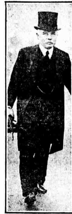
W. C. BRIDGE-MANN, British Home Secretary, received poison candy through mail