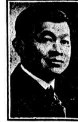
PHRA SANPA-KITCHI, appointed Siamese Minister to Rome