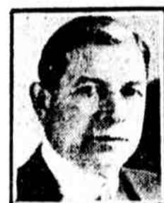
DWIGHT F. DAVIS, nominated President of U. S. Lawn Tennis Association