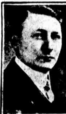
FREDERICK N. ZIHLMAN, Maryland Congressman chairman of House Labor Committee