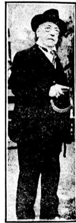
SAMUEL GOMPERS, Labor's head, has a bad pituitary boss shoes in Florida.