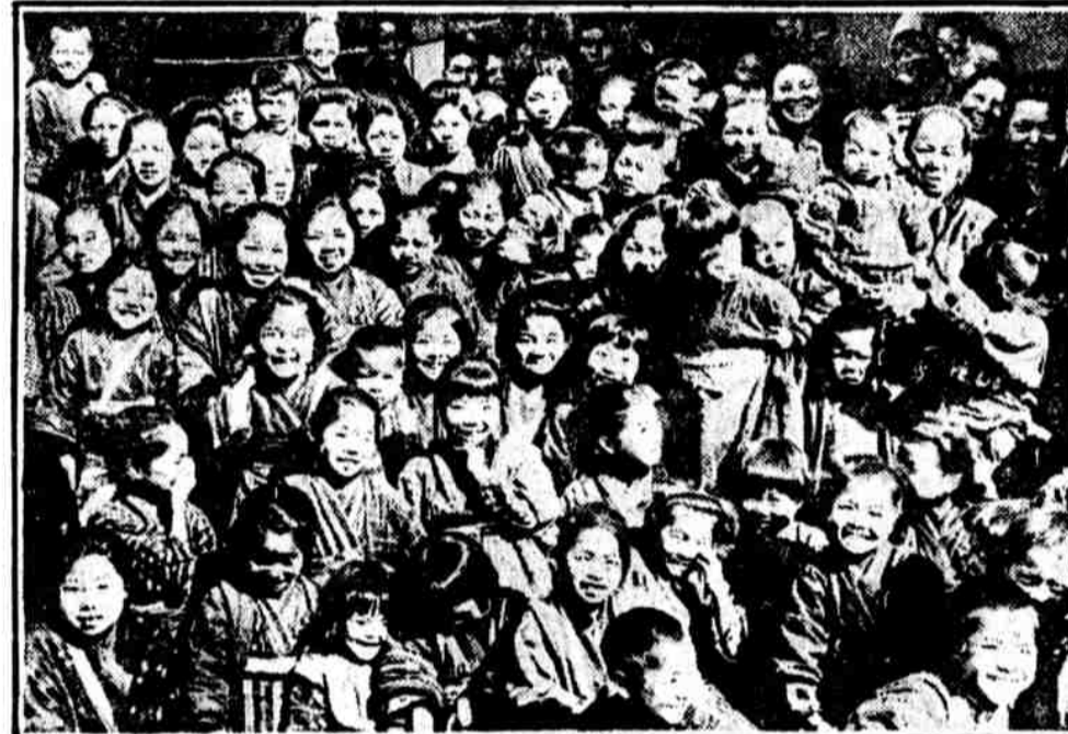
CHRISTMAS IN JAPAN. These happy Japanese kiddies are eagerly awaiting the appearance of Santa Claus at a Sunday school gathering in old Nippon, with about the same eagerness as our American youngsters.