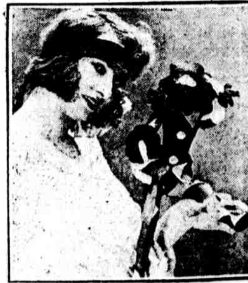
"FLIRTATION DOLL" LATEST PARISIAN FAD. Press a little button and the eyes wink and ogle outrageously