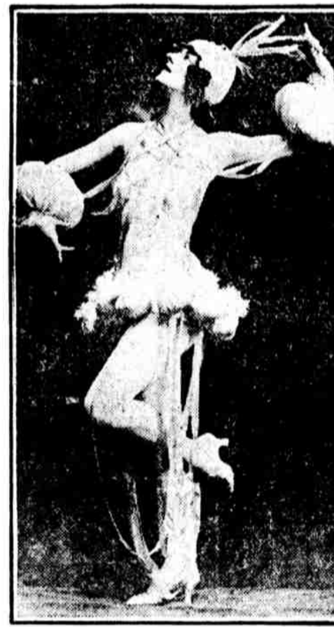
MISS NINA PAYNE, American dancer, scoring great success in Paris wearing her original onion costume.