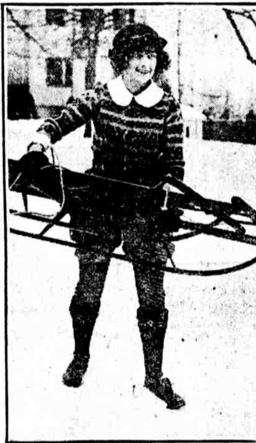
WHILE THE SNOW LASTED the above young lady did not neglect the opportunity to do a bit of coasting.