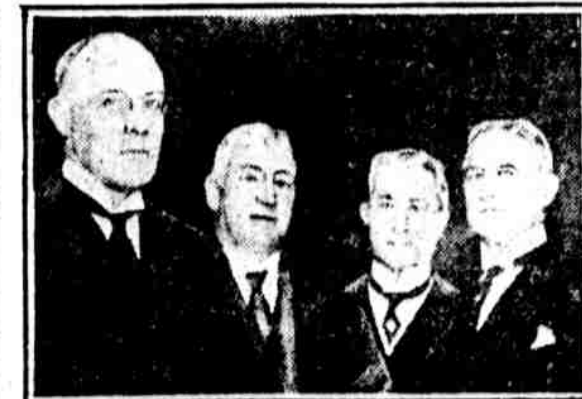
SIR AUCKLAND GEDDES, British Ambassador, attended Surgical Pavilion dedication at U. of P. yesterday. Shown above at left of University officials