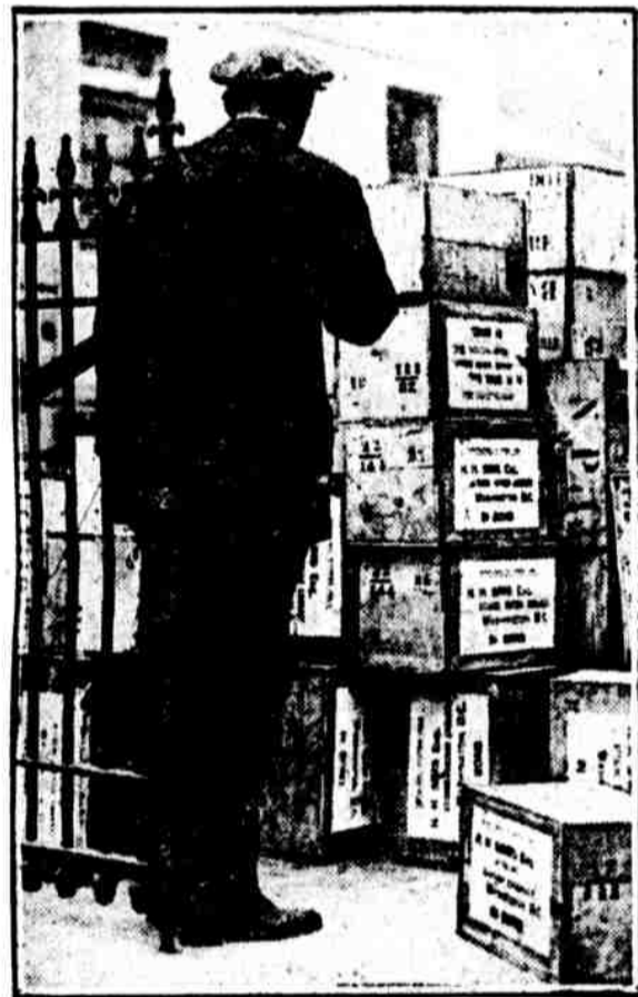
CHRISTMAS LIQUOR ARRIVES IN CAPITAL. But it is perfectly legal, as all these cases of wines and liquors are for use of one of the foreign embassies in Washington.