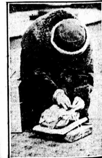
A PIECE OF STRING BROKE. The camera caught one of the incidents of Christmas shopping