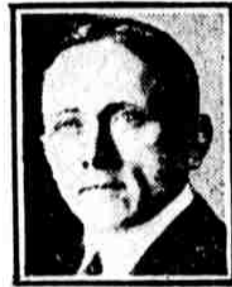
THEODORE T. BILBO, former Mississippi Governor, evades subpoenas in Russell suit