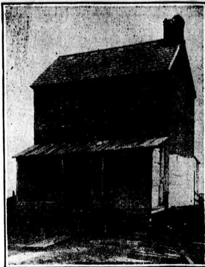
BIRTHPLACE OF JOHN WANAMAKER. This is the house in which the great merchant was born, situated in "the neck" near Landreth's seed farm