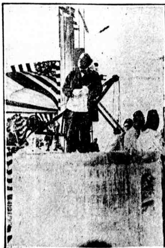
USING CORNERSTONE AS PLATFORM, William Jennings Bryan addressed largest Masonic gathering in Florida at cornerstone laying of Scottish Rite Cathedral