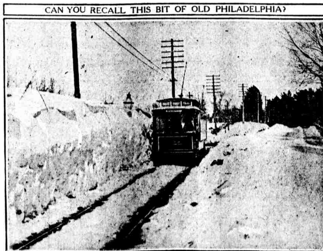
HEAVY SNOWSTORMS CHARACTERIZED THE WINTER OF 1896. An old-time trolley is shown running between canyon-like snow drifts in this picture of Old York road at Duncannon avenue, taken during that winter. Please send us your old-Philadelphia photographs