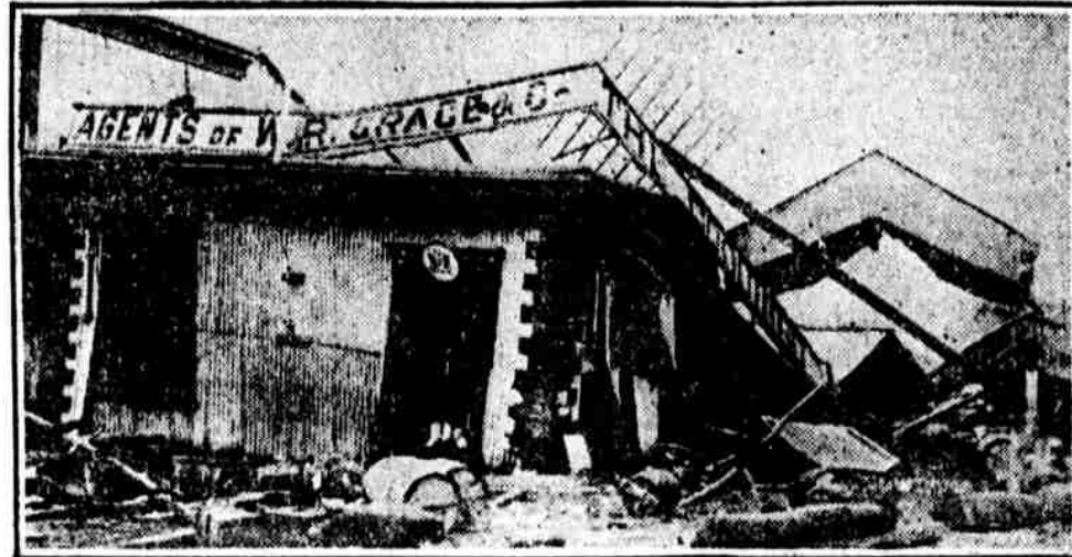
SCENE OF HAVOC WROUGHT BY EARTHQUAKE IN CHILE. All that remains of building used as American consulate at Coquimbo, reduced to ruins following the great quake and tidal wave which swept the coast