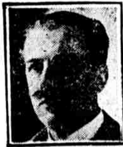
DUKE OF ABERCORN, appointed Governor General of North Ireland