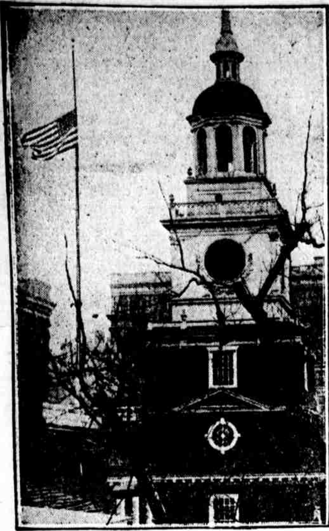
TRIBUTE TO MEMORY OF JOHN WANAMAKER at Independence Hall. For first time in city's history flags were half-staffed on municipal buildings in honor of private citizen