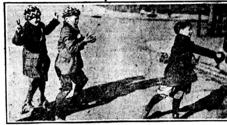
WHO SAID THE BASEBALL SEASON WAS OVER? The camera caught a "Big League" game on Thirty-third street below Walnut at a critical moment, with three "men" on bases and a pinch-hitter at the bat