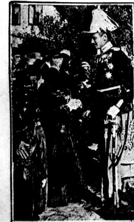
KING CHRISTIAN OF DENMARK greeting children at "All-Holland" festival, picturesque affair celebrating 400th anniversary of colony