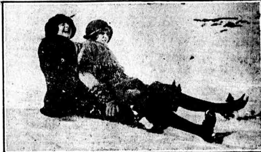
JACK FROST IS KING IN SWITZERLAND, and here are two of his "subjects" making the most of his "rule" at Murren. Sledding is now popular among the younger set at that resort