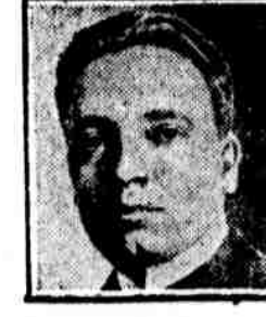
DR. BALTASAR BRUM, President of Uruguay, challenges political rival