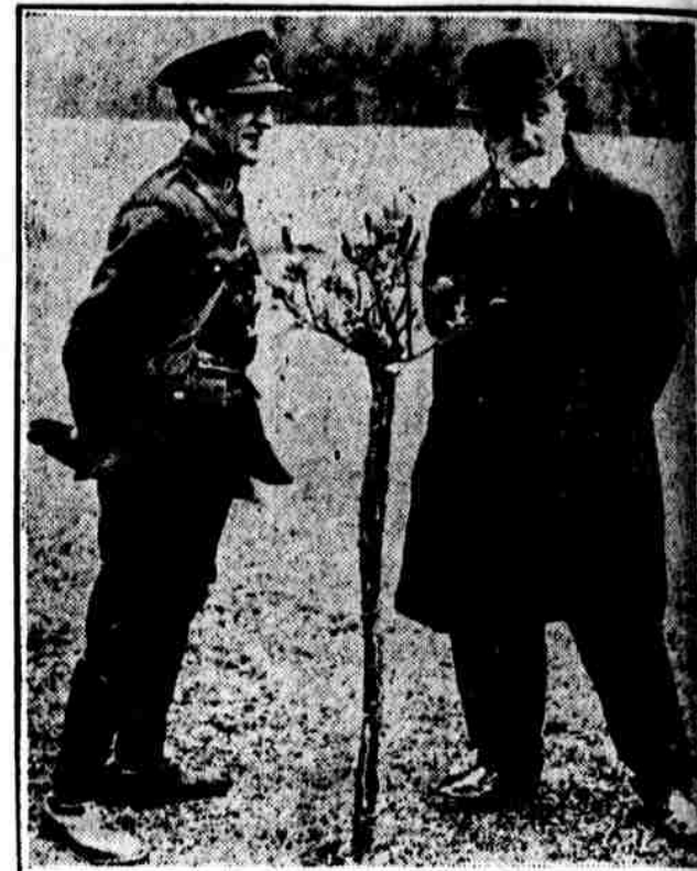
GOVERNOR-GENERAL TIMOTHY HEALY OF IRELAND is pictured above chatting amiably with a Free State trooper in the garden of his Dublin home