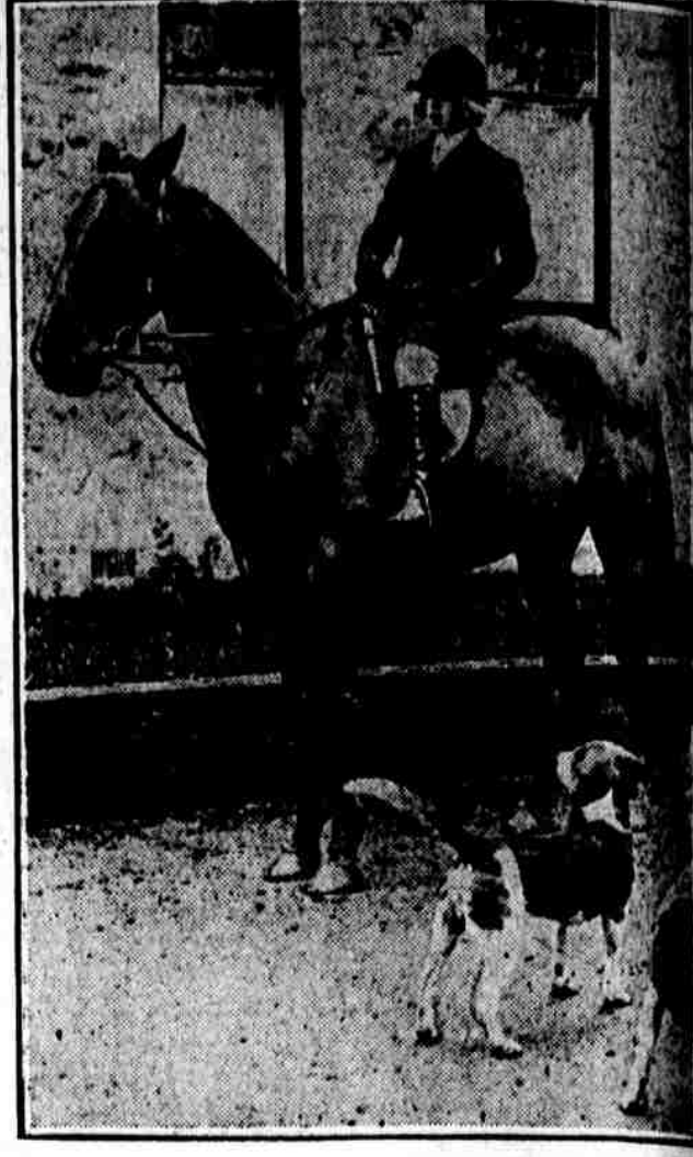
FOURTEEN-YEAR-OLD MASTER OF HOUNDS. Miss Cicely Troyte Bullock is probably world's youngest master of hounds, attaining great success recently leading the Seals House Beagles in England