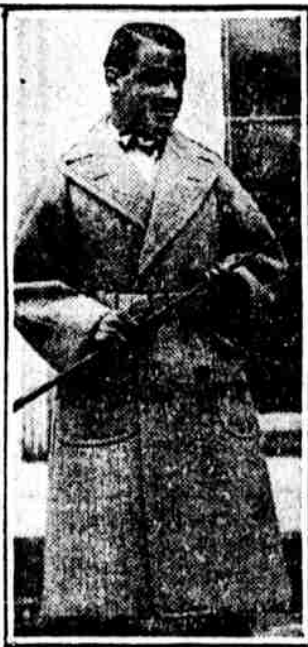
GENE SARAZEN present club used to win championship to President.