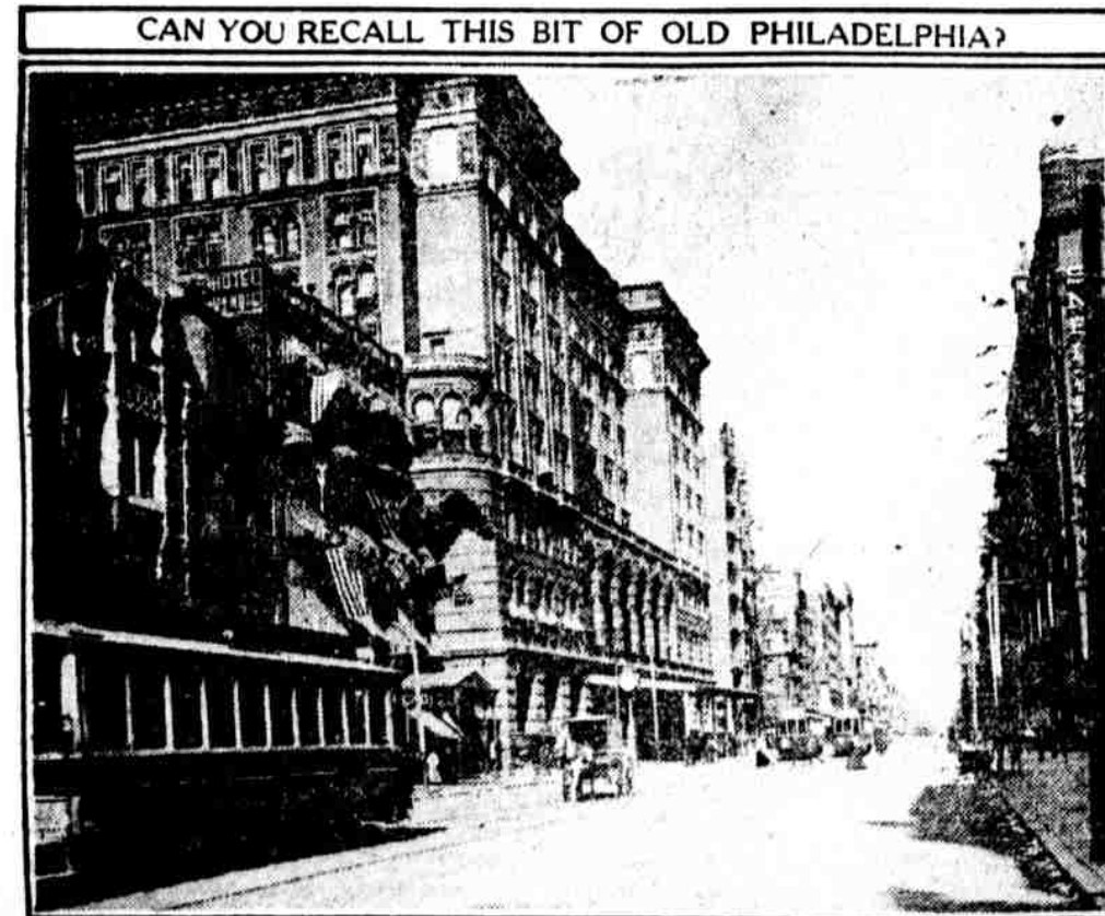
THE SOLID AND UNENDING STREAM OF AUTOMOBILE TRAFFIC of today is absent in this picture of Market street, looking east from Thirteenth, as it appeared in 1902. Send us your old-Philadelphia photographs.