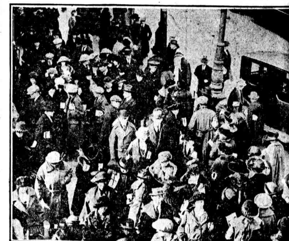
MANY TOOK ADVANTAGE OF THE FINE WEATHER on Saturday to do their Yuletide shopping early. Above is a view of the noon rush of shoppers caught by the camera at Eleventh and Market streets, attesting the rapid approach of Christmas.