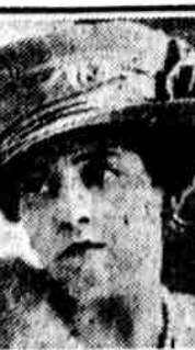
PRINCESS ANASTASIA, American wife of Prince Christopher of Greece, to visit U. S.