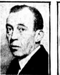
SENATOR DAVID A. REED, of Pennsylvania, receives Distinguished Service Medal.