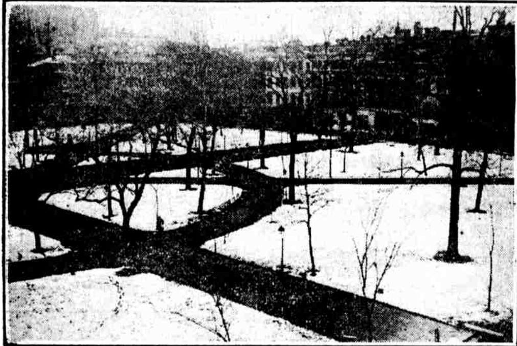
INDEPENDENCE SQUARE WEARING ITS FIRST BLANKET OF SNOW this season. Yesterday's incipient flurry, while bringing the first real taste of winter, proved a disappointment to the kiddies, its short duration dashing their visions of hobsleds and snowballs, sleigh-bells and slides.