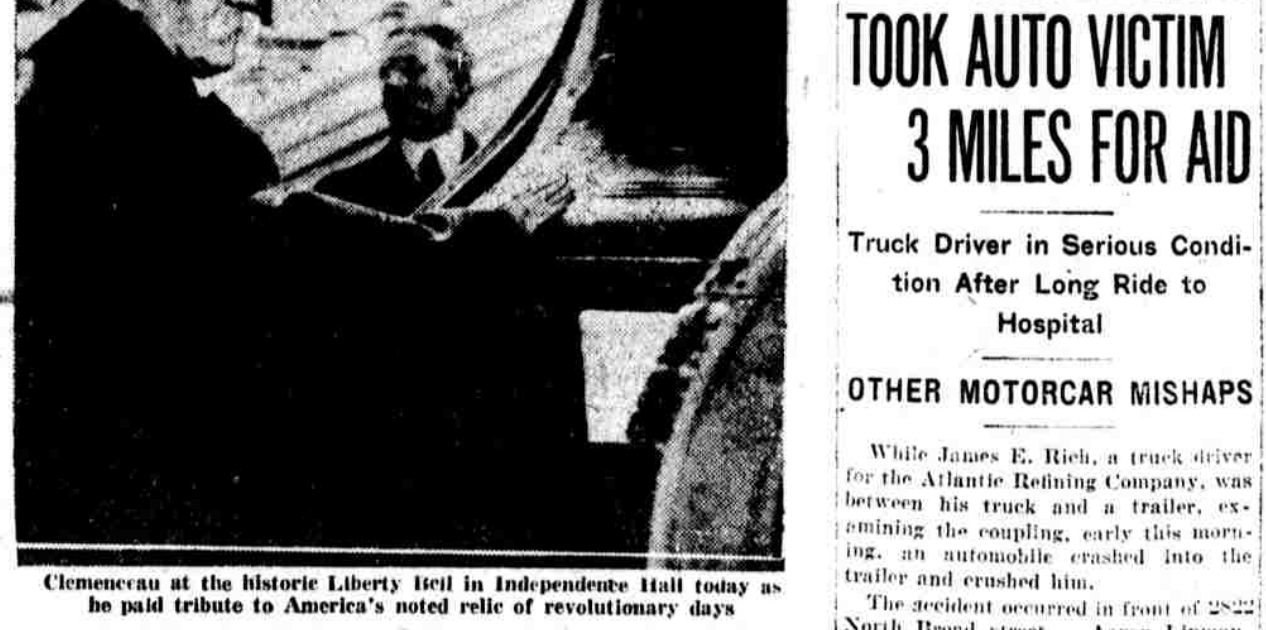
Clemenceau at the historic Liberty Bell in Independence Hall today as he paid tribute to America's noted relic of revolutionary days