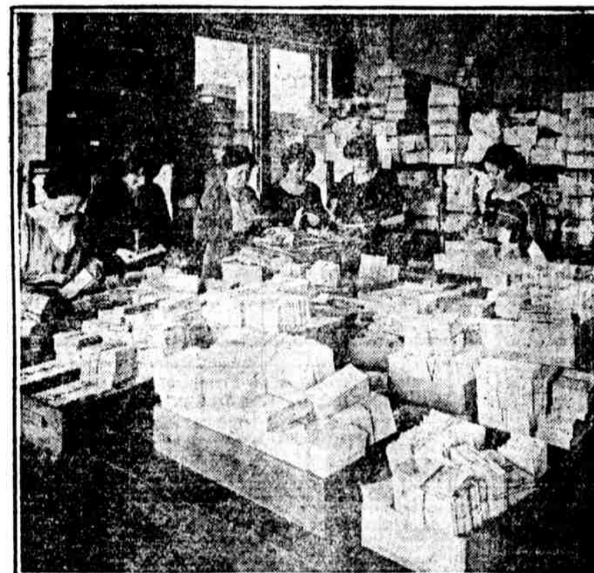
HOW MANY PIGS IN THE COUNTRY? The Department of Agriculture wanted to know, so they sent out 500,000 questionnaires. Replies to the nation-wide pig survey are now pouring into the department assuring an abundant supply