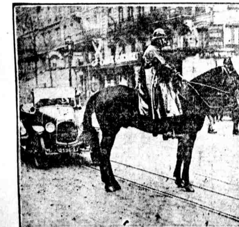
A NEW SIGHT FOR PARISIANS. France now has mounted traffic police. Above is pictured the first appearance of one of the mounted gendarmes on the boulevards