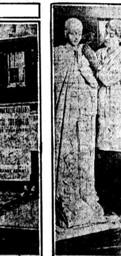
MISS ANNA VAUGHN HYATT, noted sculptress, finishing her latest statue