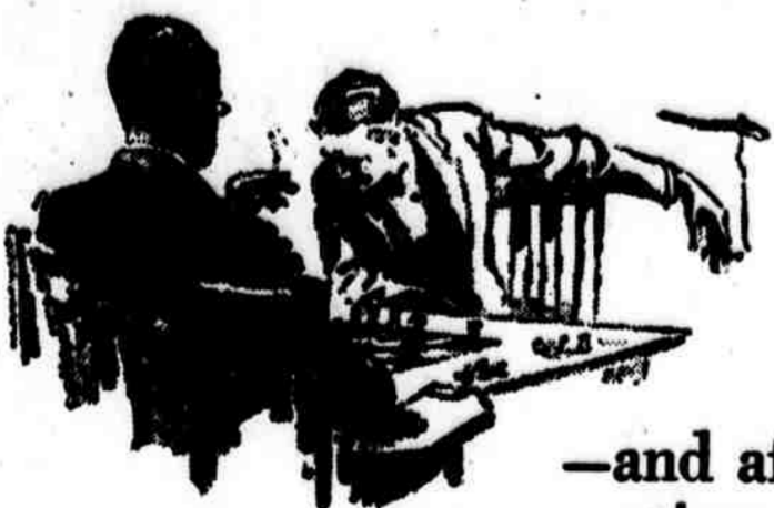
Let Fatima smokers tell you