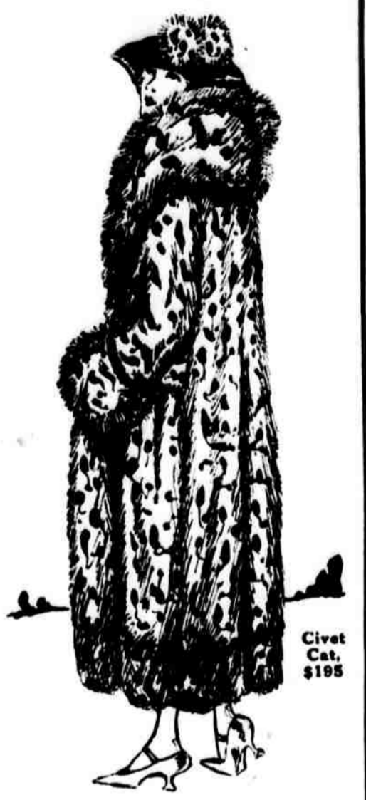
Civet Cat. $195