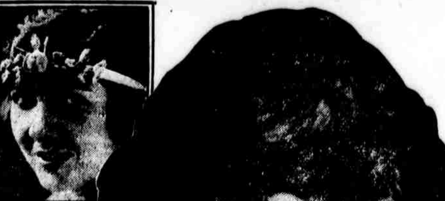
Louise Good-Morning FOREST