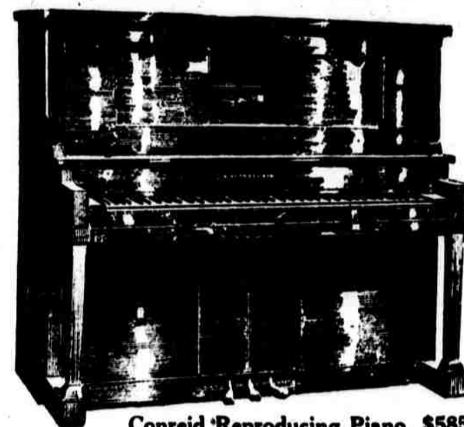
Conreid Reproducing Piano, $585

Two carloads have just come in—we have no hope of being able to supply the possible demand.