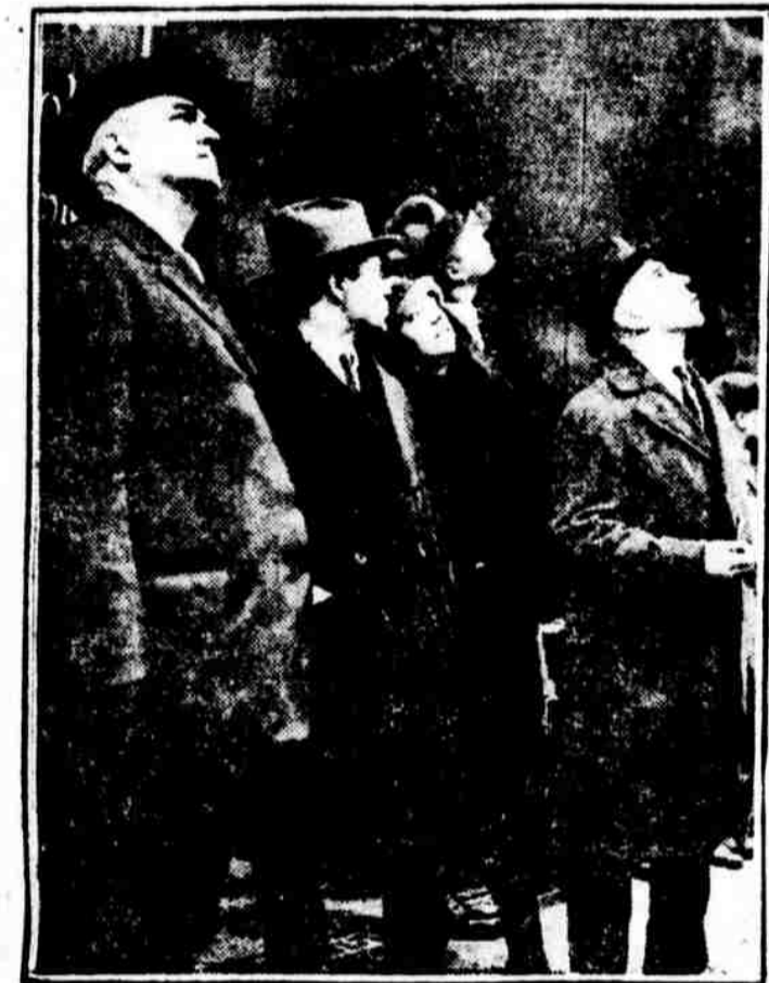
INTERESTED SPECTATORS watching iron workers nonchalantly engaged in their hazardous occupation high up on the girders of new building between Tenth and Eleventh on Chestnut