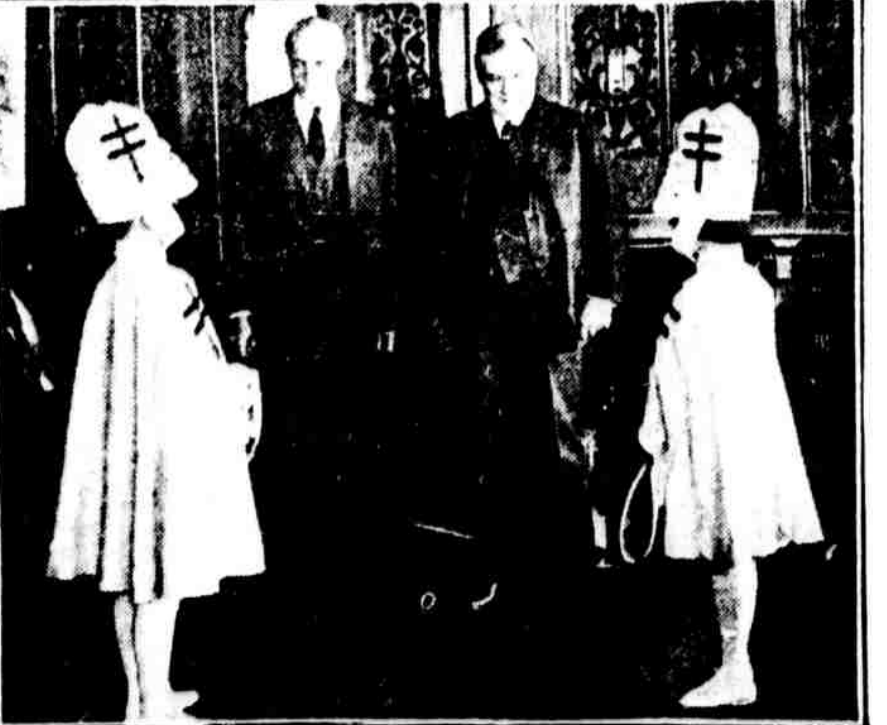
PENNSYLVANIA'S GOVERNOR-ELECT opened the 1922 Christmas seal sale at the Capitol at Harrisburg. He and Governor Sproul are shown purchasing from the Modern Health Crusaders