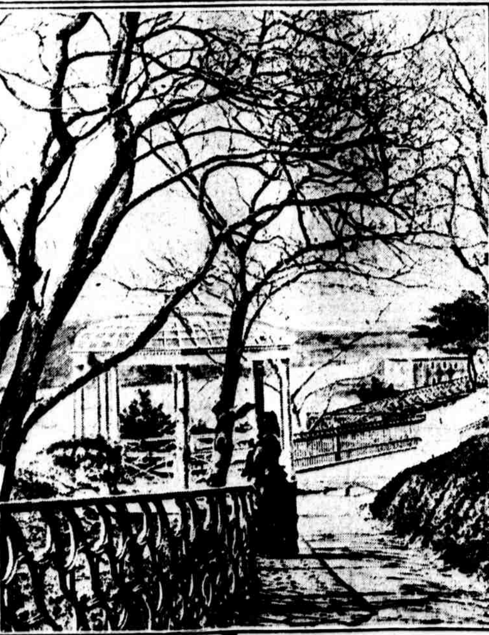
IN SILENT CONTEMPLATION OF THE BEAUTIES OF NATURE, the lone figure of a woman is disclosed in this scene of Fairmount Park near the old pumping station in 1870. Send us your old-Philadelphia photographs