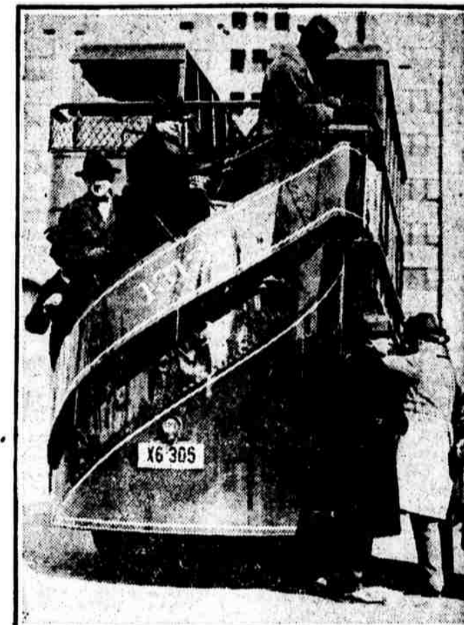
NEW P. R. T. BUS took trip over the proposed lines yesterday. Bus was photographed at a stop on the Roosevelt Boulevard