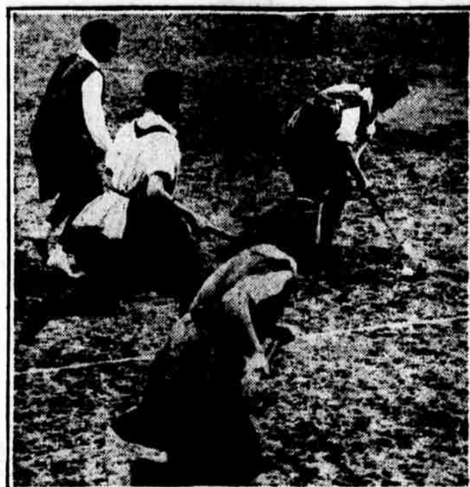
OUT FOR THE ALL-PHILADELPHIA TEAM. The camera caught some action during the trial matches at St. Martins yesterday between members of the All-Club