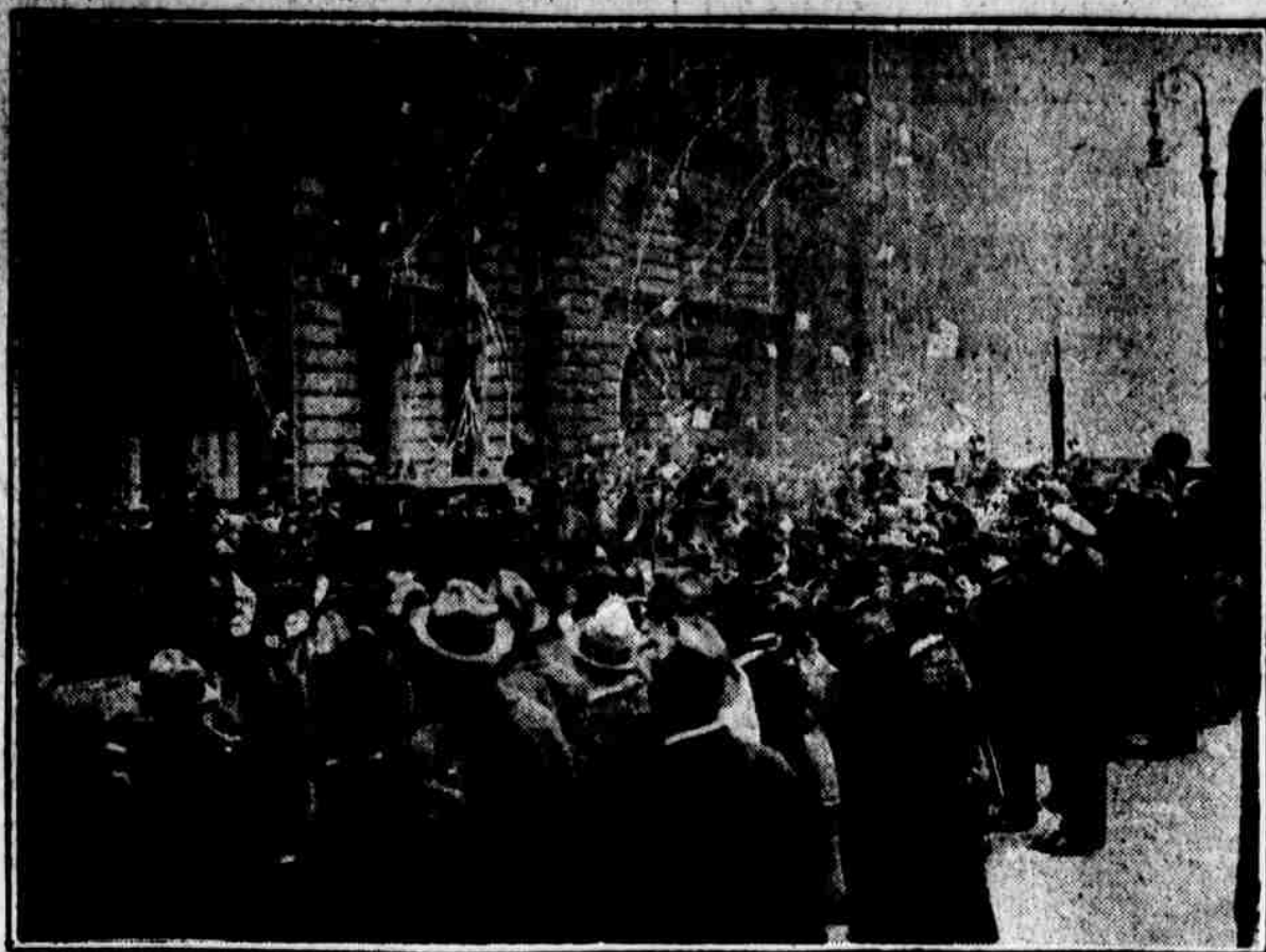
THE ENTHUSIASTIC WELCOME accorded Georges Clemenceau upon his arrival in New York presented a scene similar to the one on Armistice Day four years ago. The automobile bearing France's great statesman was showered by confetti and tape from office building windows