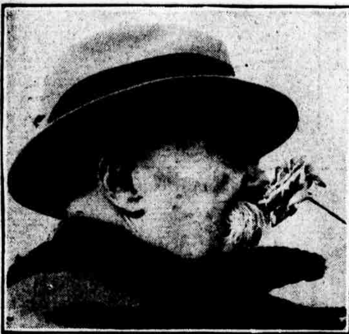
THE TIGER AND THE ROSE. Unusual picture of Georges Clemenceau enjoying perfume of American Beauty rose preferred by admirer upon war hero's arrival