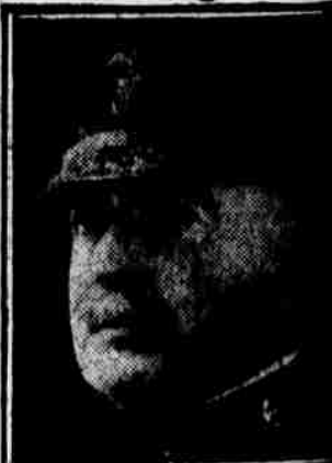
REAR ADMIRAL JOSEPH STRAUSS, to head new Navy Department Wage Board