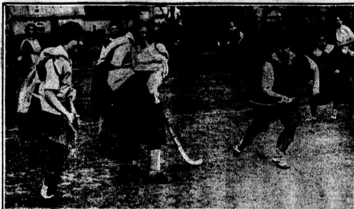
SCRIMMAGE AT ST. MARTINS during elimination game between girls of the All-School team. There are some excellent players among them, but they will have to hold a speedy pace to displace stars who fought against the British invaders last fall to qualify for All-Philadelphia team