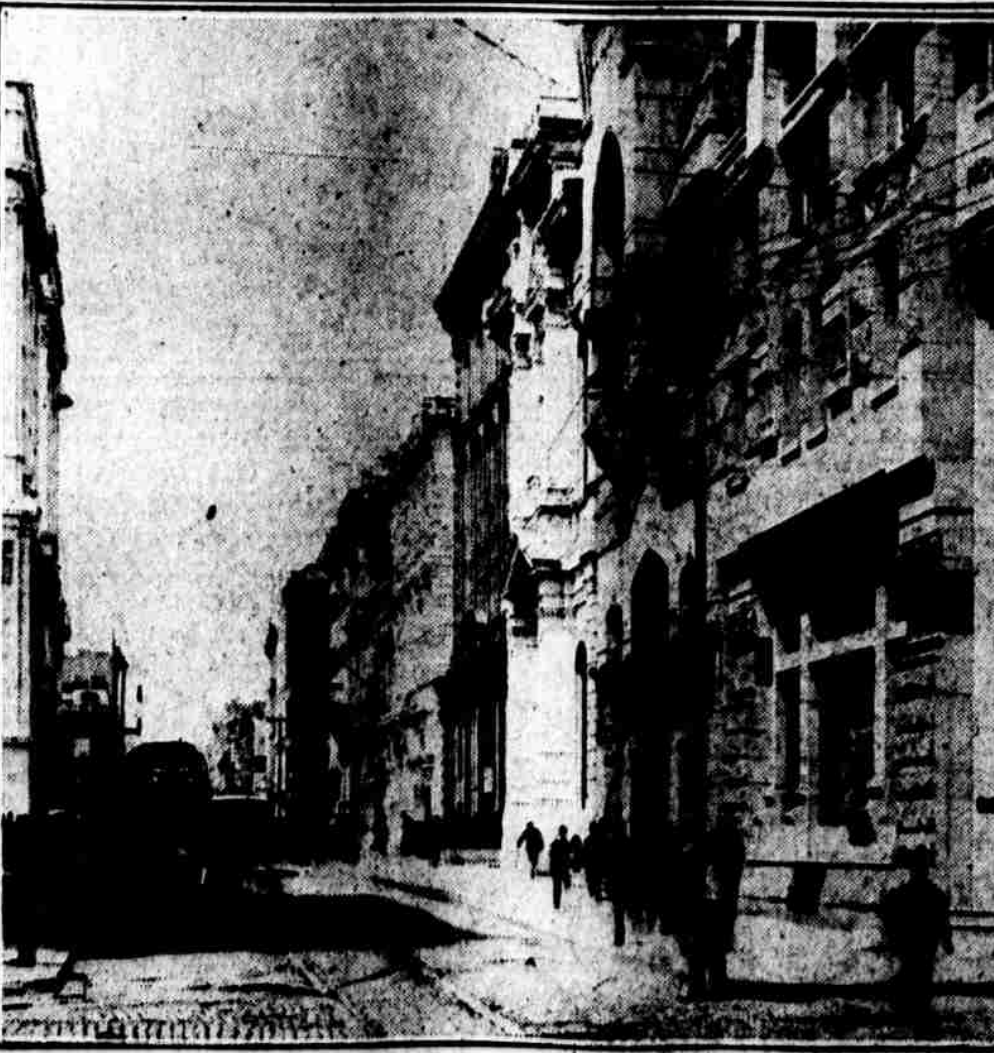
THE HEART OF THE FINANCIAL AND BANKING DISTRICT IN 1886. A view of Chestnut street looking west from Fourth as it appeared in the days of horse cars. Please send us your old Philadelphia photographs