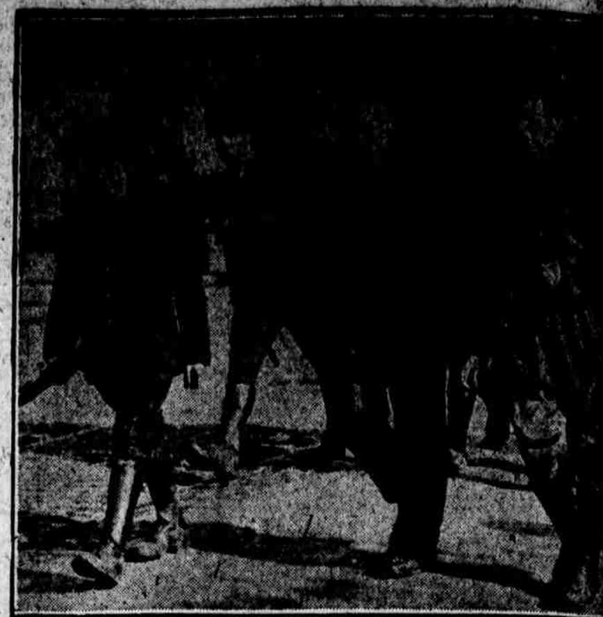
IRELAND IS STILL IN A TURMOIL. Above is pictured Irish Free State troops with captured member of the Insurgents taken during recent attack against Regulars while parading in front of Wellington Barracks, Dublin