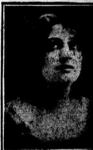
MME. CLAUDIA MUZIO, operatic soprano prima donna arrived from abroad