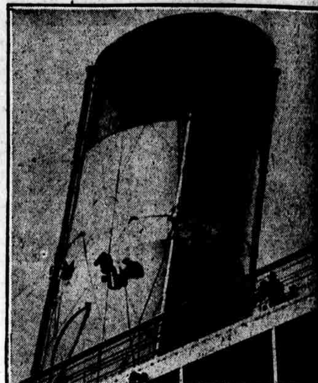
SPRUNGING UP SMOKESTACK OF S. S. MAJESTIC. Painters putting new coat on giant liner which went into drydock at Boston recently for overhauling