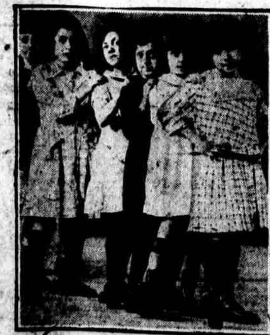
A HAPPY GROUP OF LITTLE DANCERS. Kiddies of Star Garden Recreation Center are receiving instruction in folk dancing