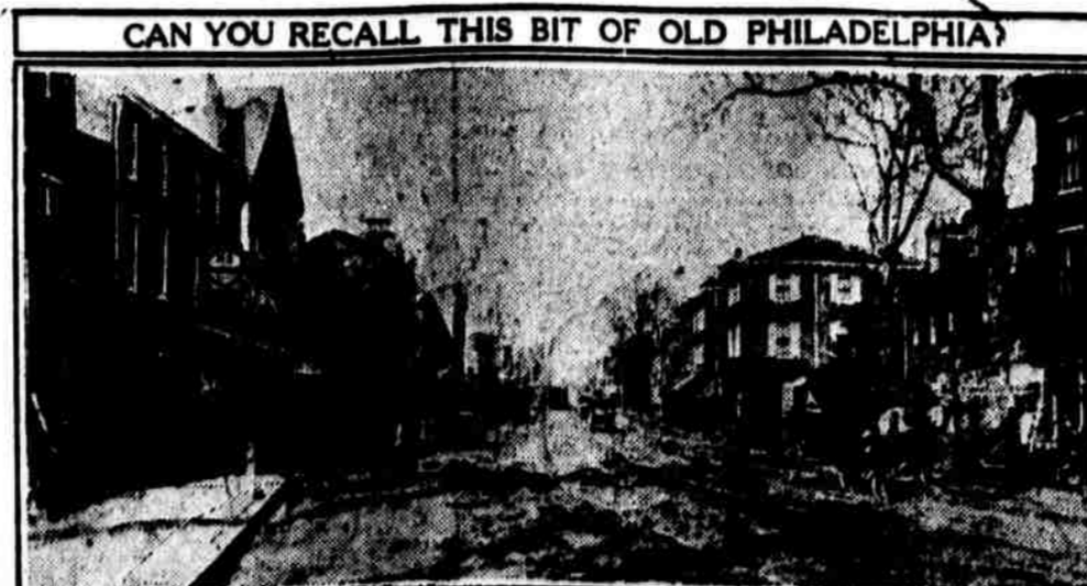
CAN YOU RECALL THIS BIT OF OLD PHILADELPHIA?