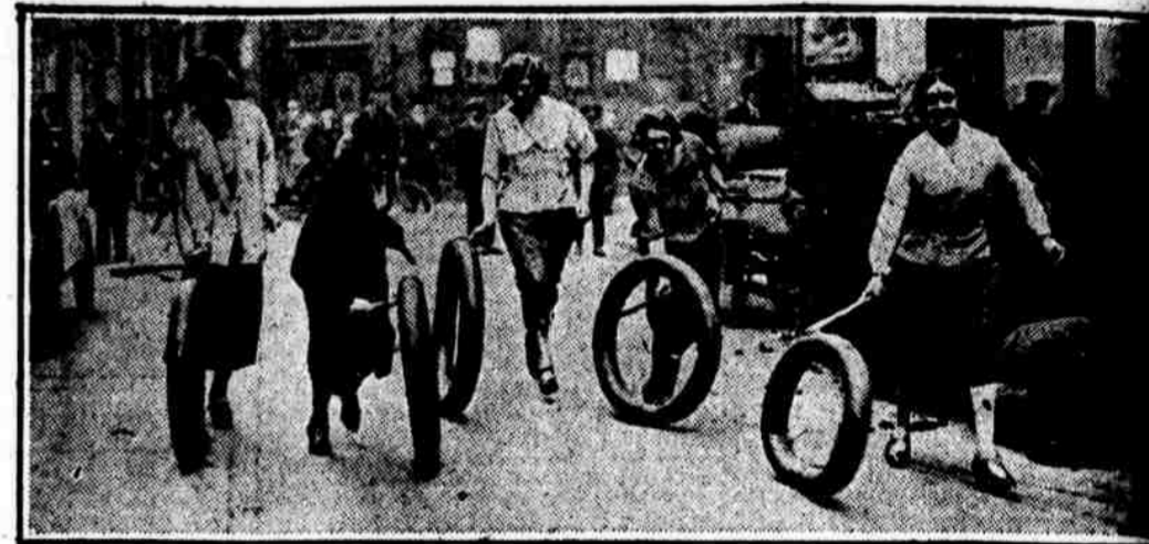
"HOOPING" IT UP IN LONDON. Instead of the traditional barrel hoops, the girls of London are rolling inflated inner tubes of automobile tires. A merry group is pictured above, getting a little exercise from the old-time sport