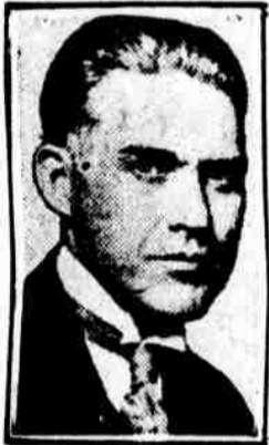
DR. HENRY SHIPSTEAD, U. S. Senator-elect from Minnesota