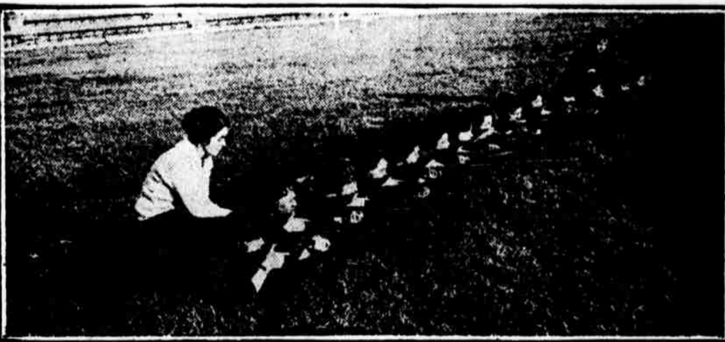
HITTING THE BULL'S EYE comes easy to these girls of the Central High School, of Washington. The fair members of this rifle team, credited with being among the most accurate marksmen in the country, shown at practice

SOCIETY AMATEURS APPEAR IN PLAYLET AT THE HOUSEWARMING ATTENDING DEDICATION OF THE PLAYS AND PLAYERS' NEW HOME AT THE LITTLE THEATRE