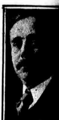
H. G. WELLS noted author slated for British Parliament