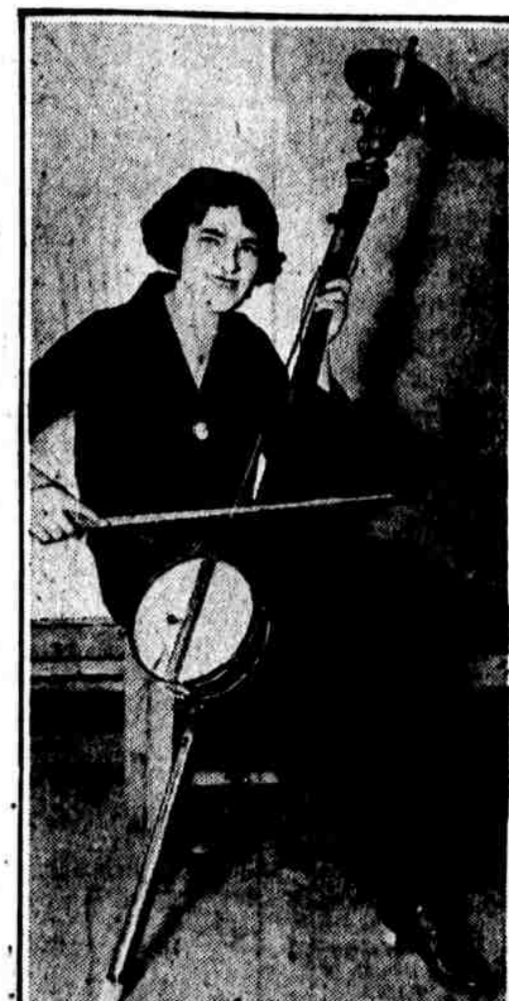
MUSIC HATH CHARMS, even when coming from weird-looking instrument shown above, known as the "Bumbo Jazz Bass"