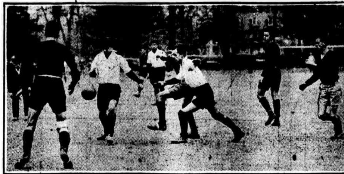
SOME STIRRING ACTION caught by the camera during the Penn Charter-Germantown Friends soccer game yesterday at Queen Lane. The fast "Friends" team was victorious, winning with the score of 2 to 0