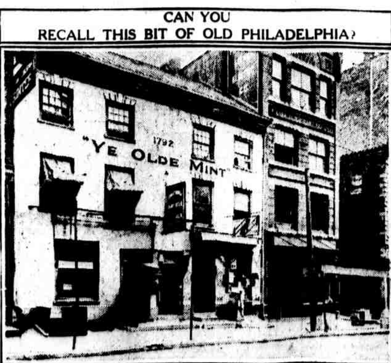
SMALL SHOPS OCCUPIED THE SITE OF THE FIRST MINT at 37 North Seventh street in 1900. Send us your old Philadelphia photographs