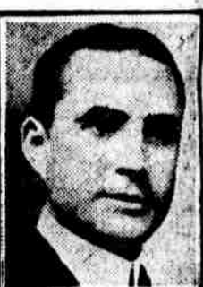
M. M. NEELY, U. S. Senator from West Virginia