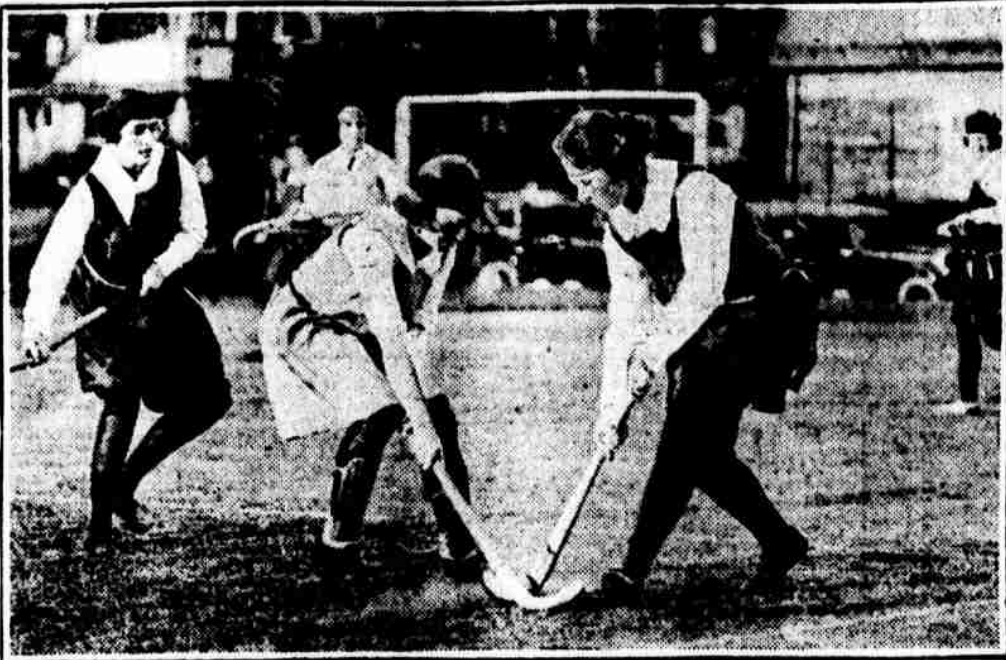
AN EXCITING MOMENT during the hockey league race which ended in a tie when the Philadelphia Yellows defeated the Reds 9 to 2 at St. Martins yesterday, necessitating a play-off game to decide the championship team