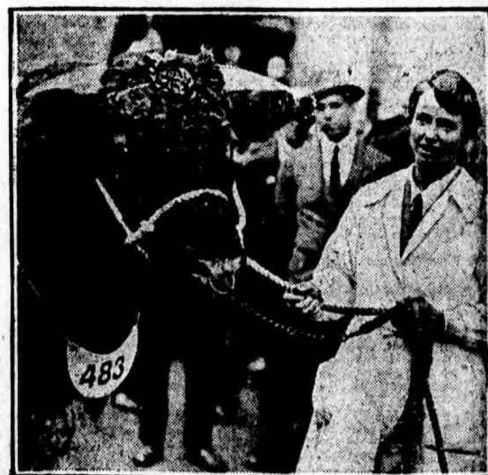
WINS FIRST PRIZE. The Duke of Westminster was the winning bull at the recent Dairy Show held at the Agricultural Hall, Islington, England