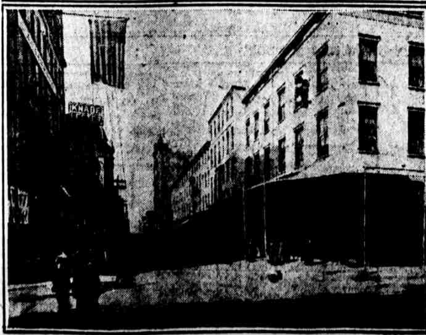
THE MODERN FLAPPER was an unknown quantity on Chestnut street in 1885. Looking west on that thoroughfare from Thirteenth, showing old Wanamaker store on the right. Send us your old Philadelphia photographs