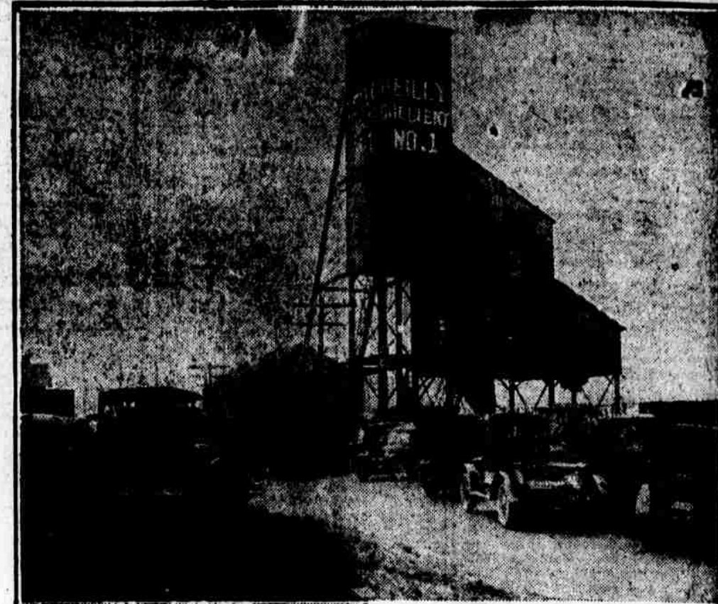
SCENES FOLLOWING THE TRAGIC MINE DISASTER AT SPANGLER, PA. On the left is shown the temporary morgue established in the Miners' Hall, used in happier days as a dance pavilion and community gathering place. Many heart-rending scenes took place as the families of the dead miners waited outside for their turn to go in to identify their loved ones. All day, in groups of ten, silently weeping mothers and wives walked hesitatingly down the three aisles of the dead in search of sons and husbands. In the center, the grim task of loading the dead in trucks is pictured. The shaft of the Reilly Colliery No. 1, where explosion occurred, is shown on the right