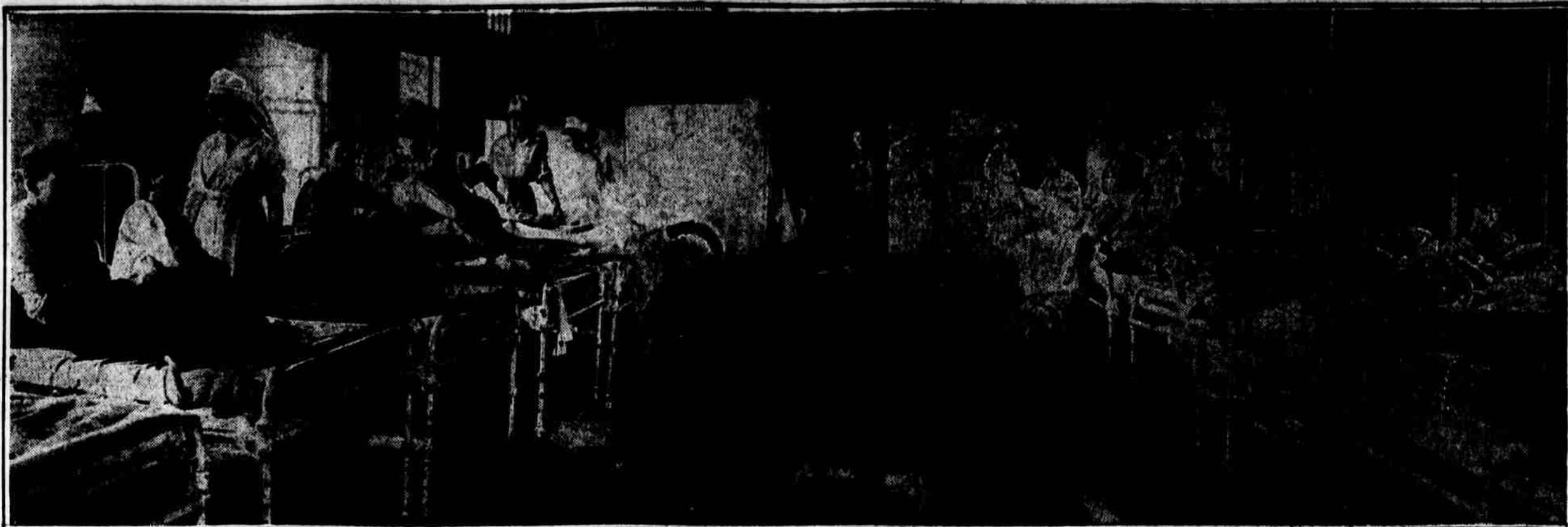
SURVIVORS OF THE TRAGEDY AT SPANGLER, PA. Above is a scene in the Miners' Hospital, showing some of the survivors of the explosion which took a toll of eighty lives. Thirty-two injured are still in the hospital under the constant care of sleepless doctors and nurses, who came from the surrounding country at the first hurry-call for medical assistance. Scenes of joyful reunion of loved ones here are in strange contrast with the painful scenes enacted at the morgue where sad-eyed wives and children search for and find their kin