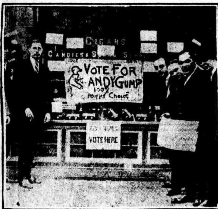
GUMP ADHERENTS used strictly legitimate means in campaign to elect their uncollared candidate. At 58th and DeLancey, a banner urged all to vote for Andy Gump