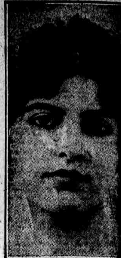
LADY LISBURNE, Chile, artist-photographer's selection as one of the most beautiful women in world