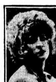
Dolly May, voted most beautiful English stage star