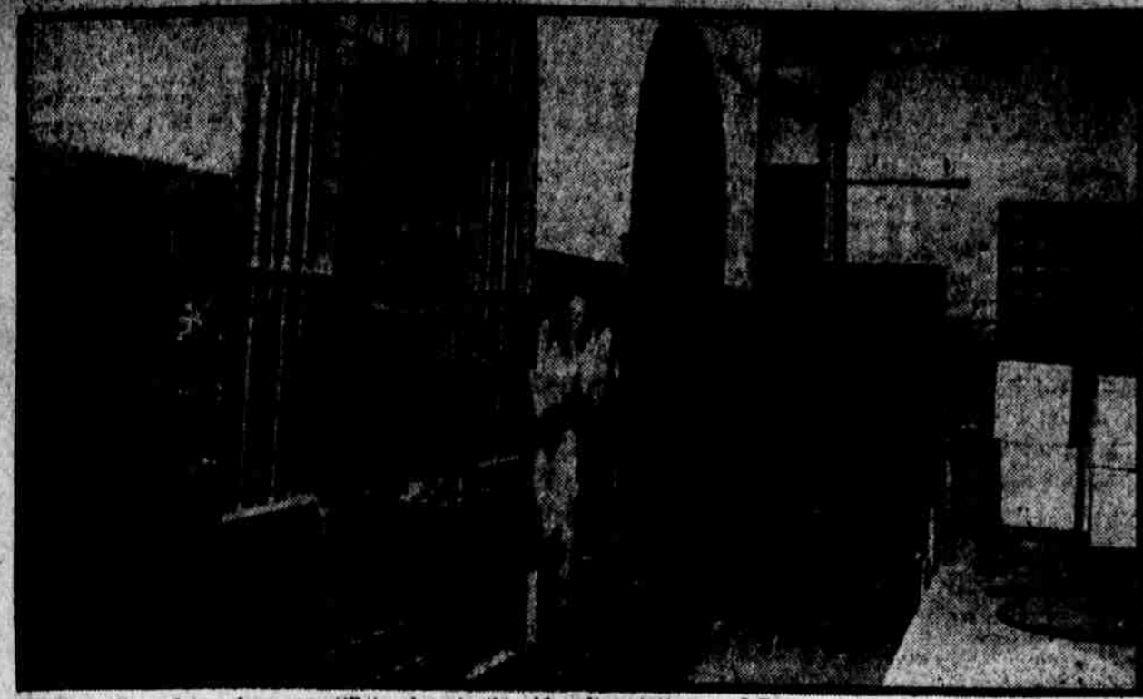
The cells and iron bars are still in place in the old police station on Jefferson street above Twentieth street, used as an annex to the Reynolds Public School.