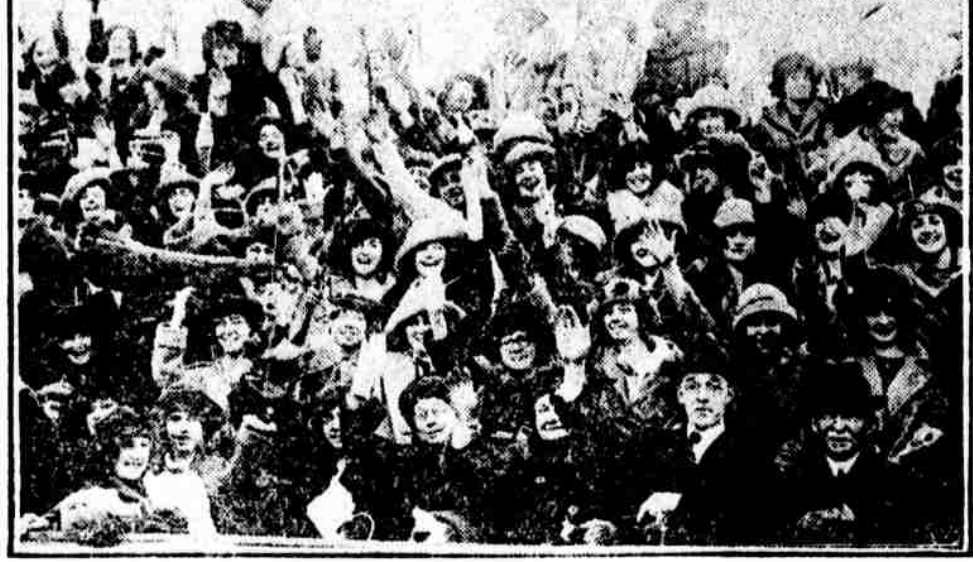
FRANKFORD'S SENSATIONAL RALLY TIES WEST PHILA. HIGH. A group of enthusiastic Frankford rooters is shown on the left, wildly cheering in the third period, when Frankford High School tied the score, 7 to 7. On the right is pictured a scrimmage at a tense moment in the contest. The game ended with the ball in Frankford's possession on the Speedboys' 40-yard line