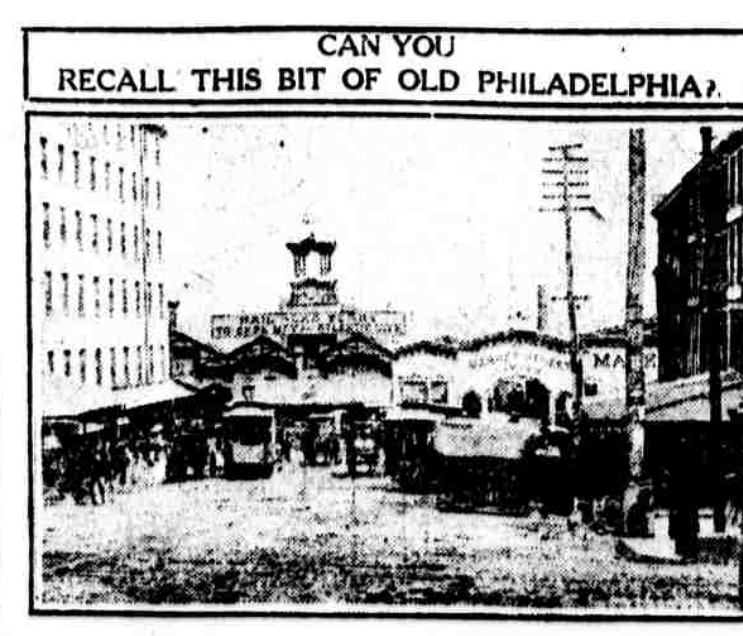
THE ROAR OF THE ELEVATED WAS MISSING. Foot of Market street in 1889, showing the P. R. R. ferry house. Send us your old Philadelphia photographs