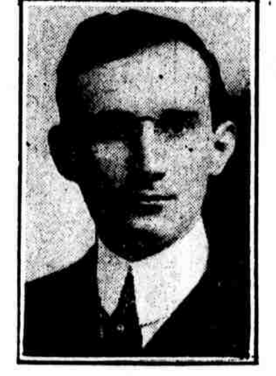
JUDGE HARRY S. Mc-DEVITT talks of the drug laws in Editorial Page inter-