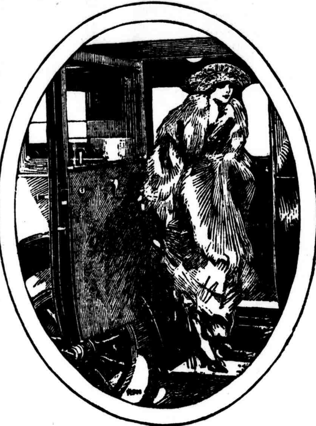
The De Luxe Car of the Year