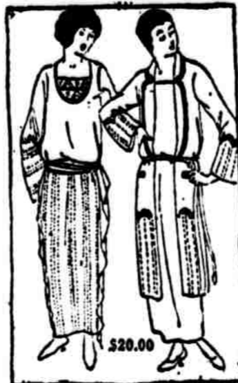
200 Dresses at

Strawbridge & Clothier—Third Floor, Filbert Street, West