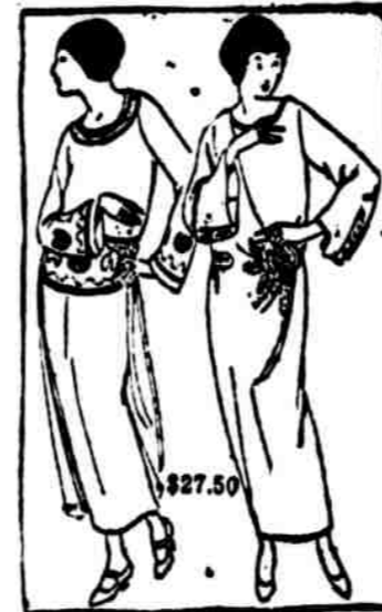
200 Dresses at

Canton Crepe and Poiret Twill, Serge and Tricotine Dresses, also Cloky Blouse Dresses with twill skirt. A great assortment—including circular draped styles, straight-line models with one-sided lapel and smartly draped sash and surplice effects. Handsomely beaded sleeves, satined panels, jeweled buckles, bonnaz embroidery, flat silk braid and beaded cabochons for trimming. Regular and extra sizes. Black, navy and brown.