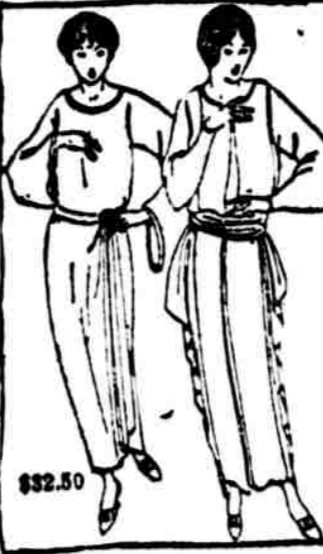
Boys' Suits with

Dresses of Poiret twill and tricotine in draped coat style or circular effect, with drapery drawn to one side and finished with silk embroidery and round neck-line with one-sided surplice closing; another straight-line model has a circular side skirt and a wide color-embroidered band at waist-line, giving a very smart effect. One model has loose braided panel and new flaring sleeves. Some models are embroidered or beaded.