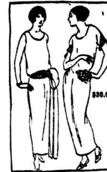
200 Dresses at

Very smart Poiret Twill Dresses in navy blue and black, and tricotine in brown; in blouse-back models. Trimmed with novelty braid, flat silk braid in basket weave or embroidery, in contrasting color, or colored duveline facings. Also Canton Crepe Dresses, regular and extra sizes, with draped skirts, steel bead trimming, pin tucks, lace collars or novel girdles.