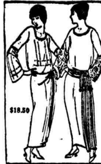
200 Dresses at

Of all-wool chinchilla cloth, with warm wool lining and convertible collar. In tan, navy blue, brown and gray. Sizes 3 to 10 years—$13.75.