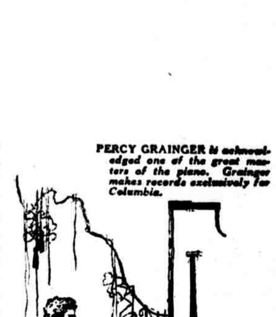
Put These New Process Columbia Records to the Hardest Comparison Tests!

Go hear these Columbia Records! Take this list with you! Note the smoothness and fullness of Columbia tone! Note the beauty of expression! Note the seeming presence of the actual voice or instrument! GO hear these records to-day.