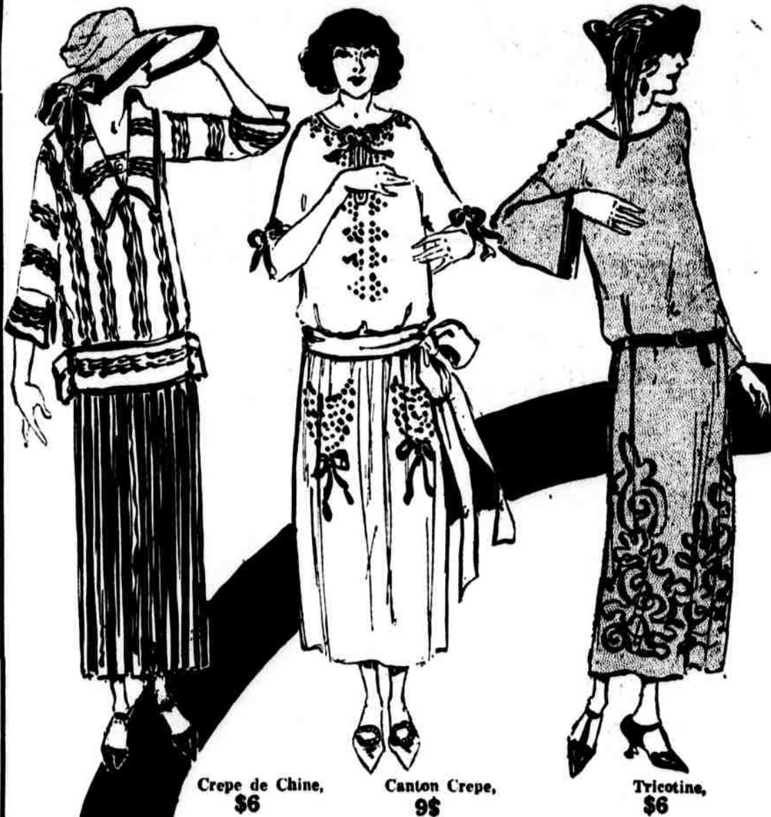
Crepe de Chine, $6

Tricotines —with inserts of braid. Serges —with flying-rows of flat silk braid. Canton Crepes —with the long flowing sleeves elaborately nail-beaded. Crepes de Chine —with pleated, pointed flying panels.