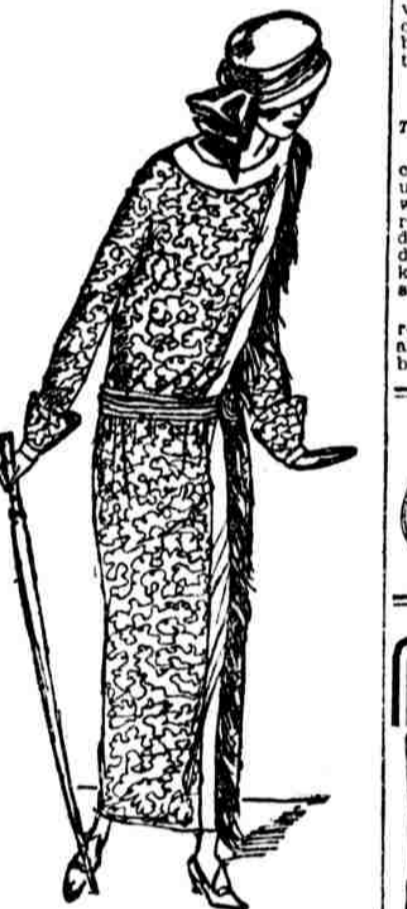
By CORINNE LOWE

We have certainly not thrown down, but picked up, the gauntlet this present year of grace. These gauntlets are of course the last cry in gloves, and they make their appearance on every type of gown, including the ceremonial bridal robe. They represent a touch of something we have borrowed this year from Cavalier modes, and they ally themselves with the short cape. This is sometimes an exact copy of the one worn by D'Artagnan in "The Three Musketeers," and the wide collar to make this touch a very distinct influence in the mode. Often the gauntlet cuff is of fur, but on this coat frock of brown matelasse this feature is carried out in self material with a narrow wristband of the plain brown crepe which finishes the neck and side closing. A folded girdle of this crepe is fastened with a clasp of gold and jade. Black monkey fur accompanies the side closing. Incidentally one remarks that this belt has lost none of its former popularity.