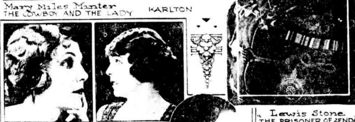
Mary Miles Minter THE COWBOY AND THE LADY KARLTON