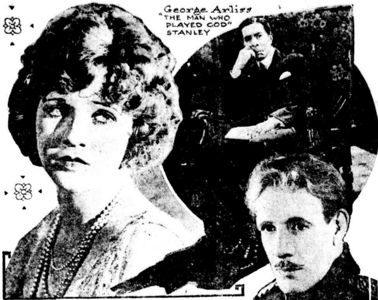
George Arliss "THE MAN WHO PLAYED GOD" STANLEY