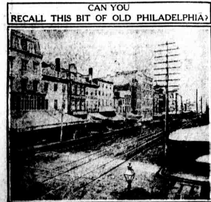
NO TRAFFIC COPS THEN. They weren't needed. This is how Market Street appeared, looking east from Ninth Street, in 1870. Send us your old Philadelphia photographs