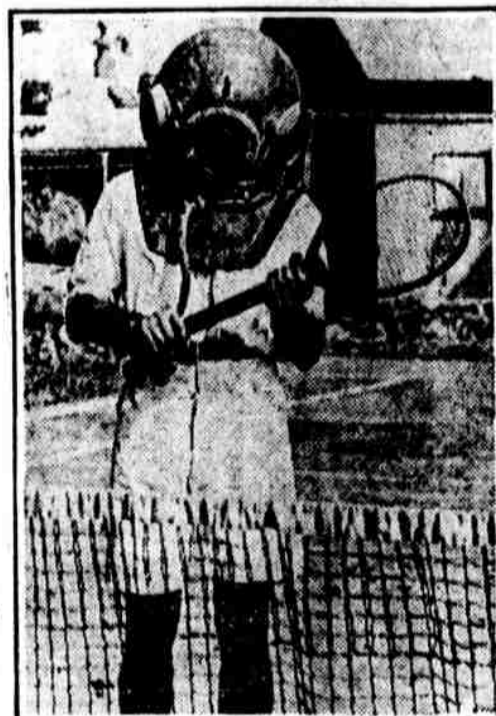
A NOVEL BET. The helmeted tennis player couldn't see, and his opponent, wearing diving shoes couldn't run. So neither won