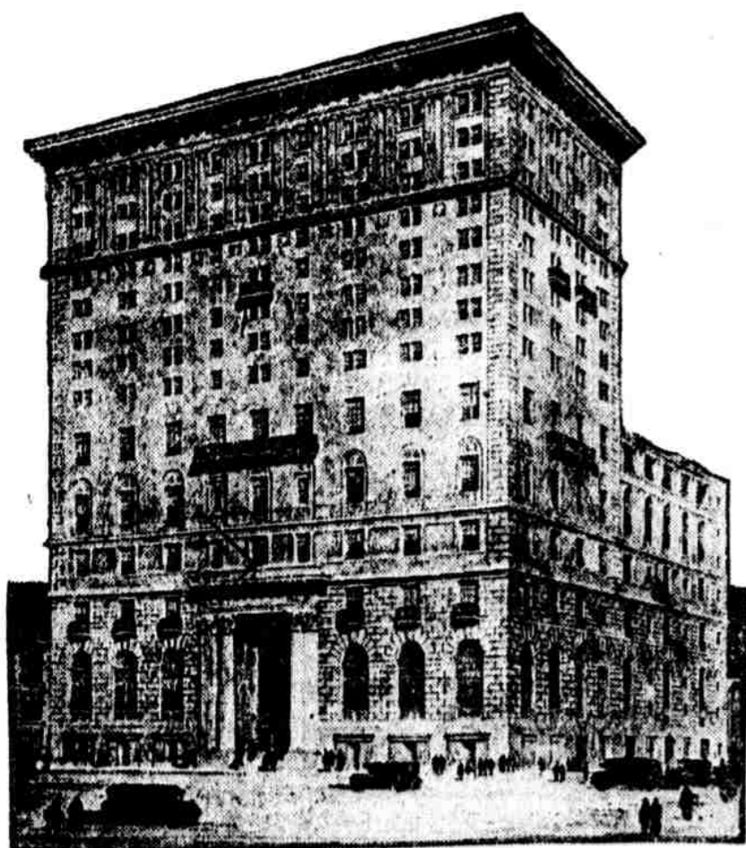
A Cause for Civic Pride

The bonds will be sold at par of $100 in denominations of $100, $500 and $1000.