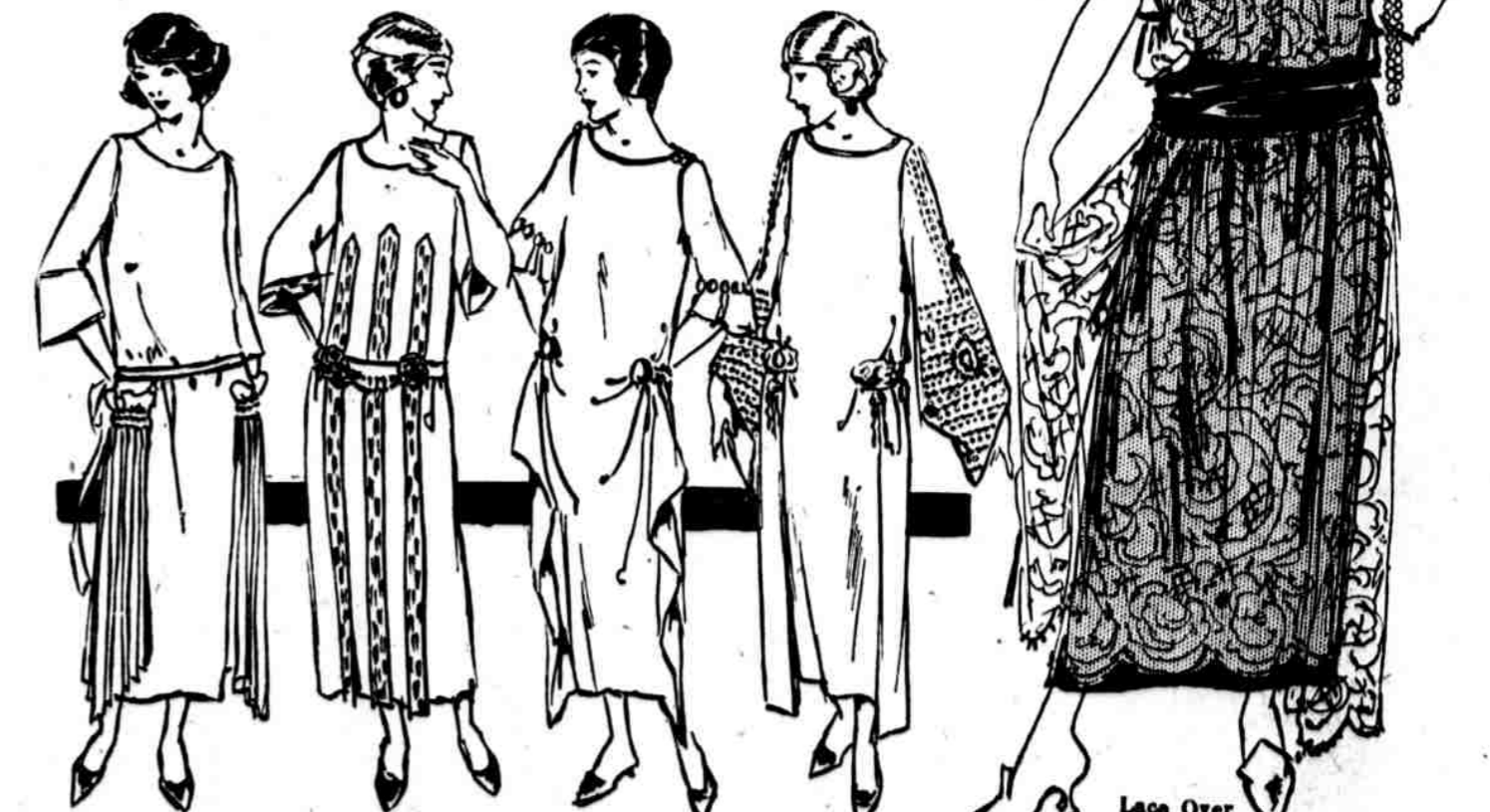
Canton and Charmeuse, $10

Plenty of misses' sizes—especially for ages 16 and 18. Plenty of women's regular sizes—36 to 44. And a wonderful assortment of extra-size models—46 to 52.