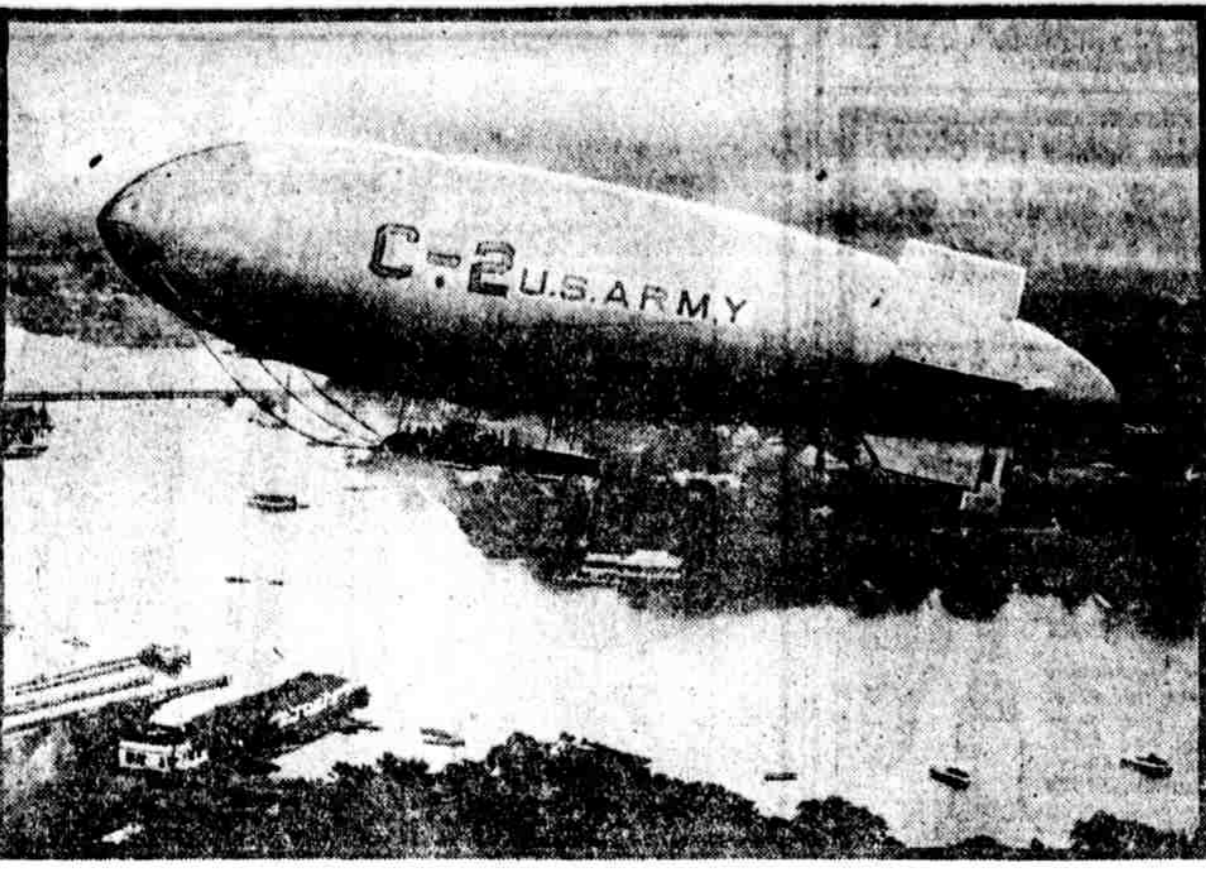
The army dirigible C-2 as it appeared when it left Langley Field September 14 on a trans-continent flight. The blimp exploded today at San Antonio, Tex., which it had reached on its return trip to Washington.