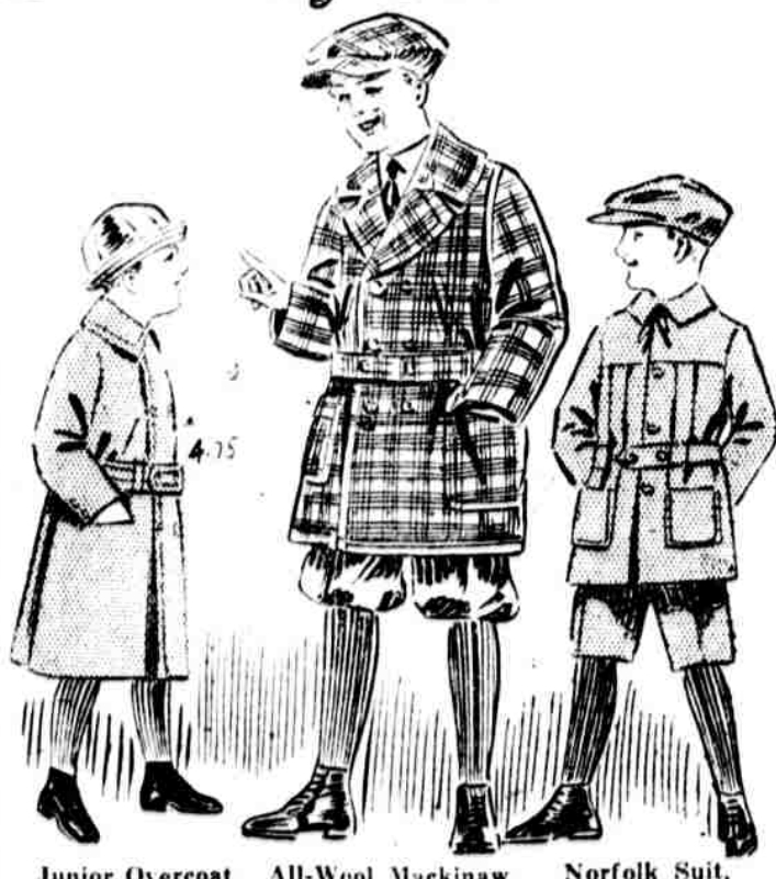
Junior Overcoat, $4.75 All-Wool Mackinaw, $6.75 Norfolk Suit, $4.75

Warm and mighty serviceable. Pictured. Ages 9 to 17 years, at $6.75