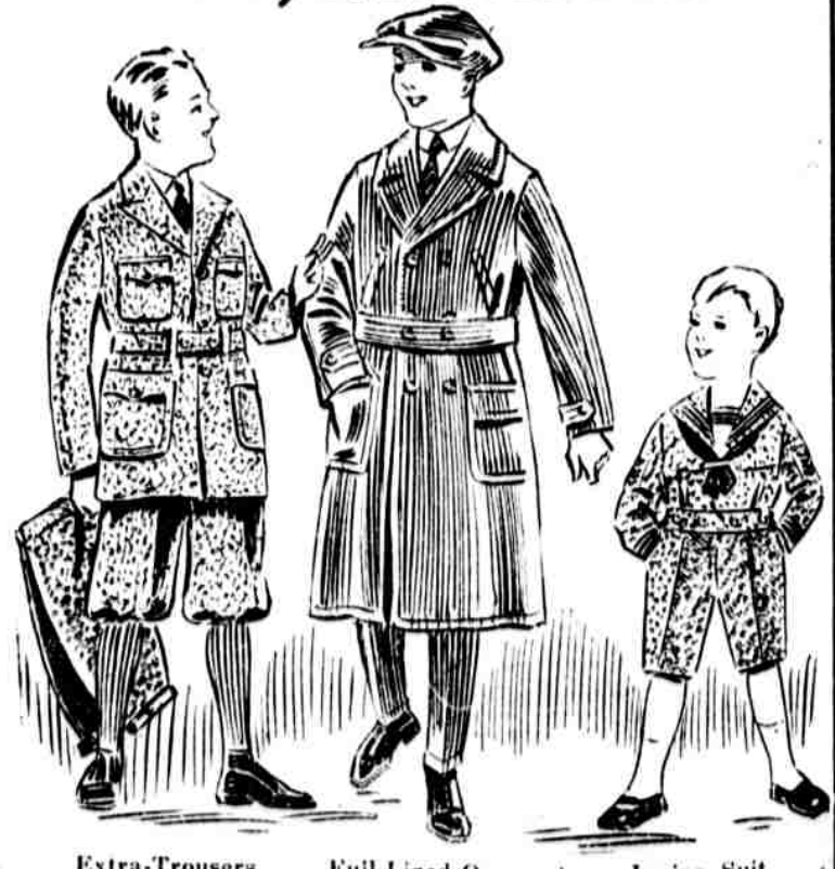
Extra-Trousers Corduroy Suit, $6.75 Full-Lined Overcoat, $6.75 Junior Suit, $4.75

—Gimbels, Anniversary Sale, Subway Store