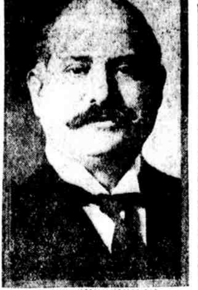
ISAAC GUGGENHEIM Copper magnate, native of Philadelphia, who died today at Southampton, England.