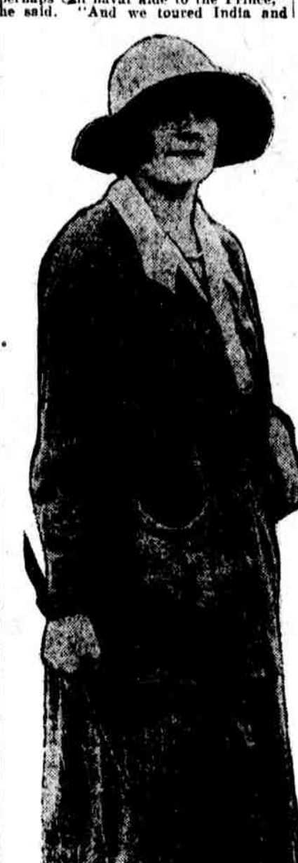
On the golf links at home

-seemed a trifle shy. They were both Some say that was the beginning of both anticipatory of their three months in a new and exciting south.